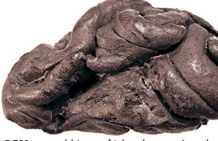
A 5,700-year-old type of 'chewing gum' made from birch pitch found during archaeological excavations at Syltholm, southern Denmark.

chewed by a female hunter-gatherer from mainland Europe than hunter-gatherers from central Scandinavia," the researchers wrote in the study. "The individual who chewed the pitch was female and that she was genetically more closely related to western