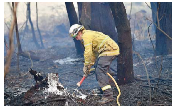
A firefighter douses a bushfire in Dargan, 130 kilometres north-west of Sydney on Wednesday.