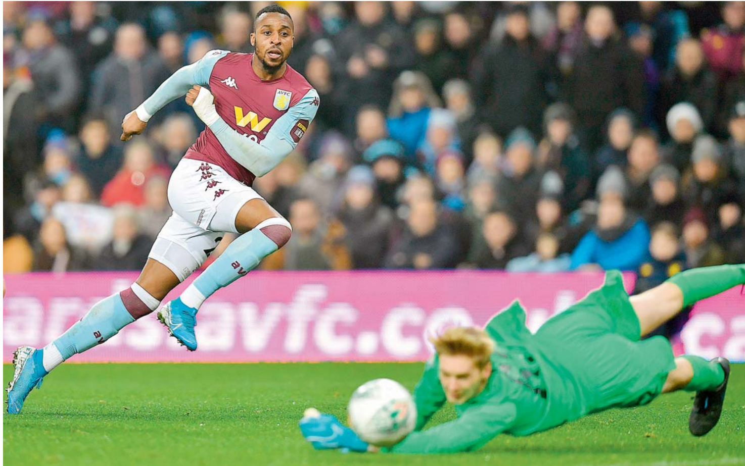
Aston Villa's Jonathan Kodjia's (left) shot is deflected by Liverpool's goalkeeper Caoimhin Kelleher during their English League Cup quarterfinal match at Villa Park in Birmingham, central England, on Tuesday. Aston Villa won 5-0.