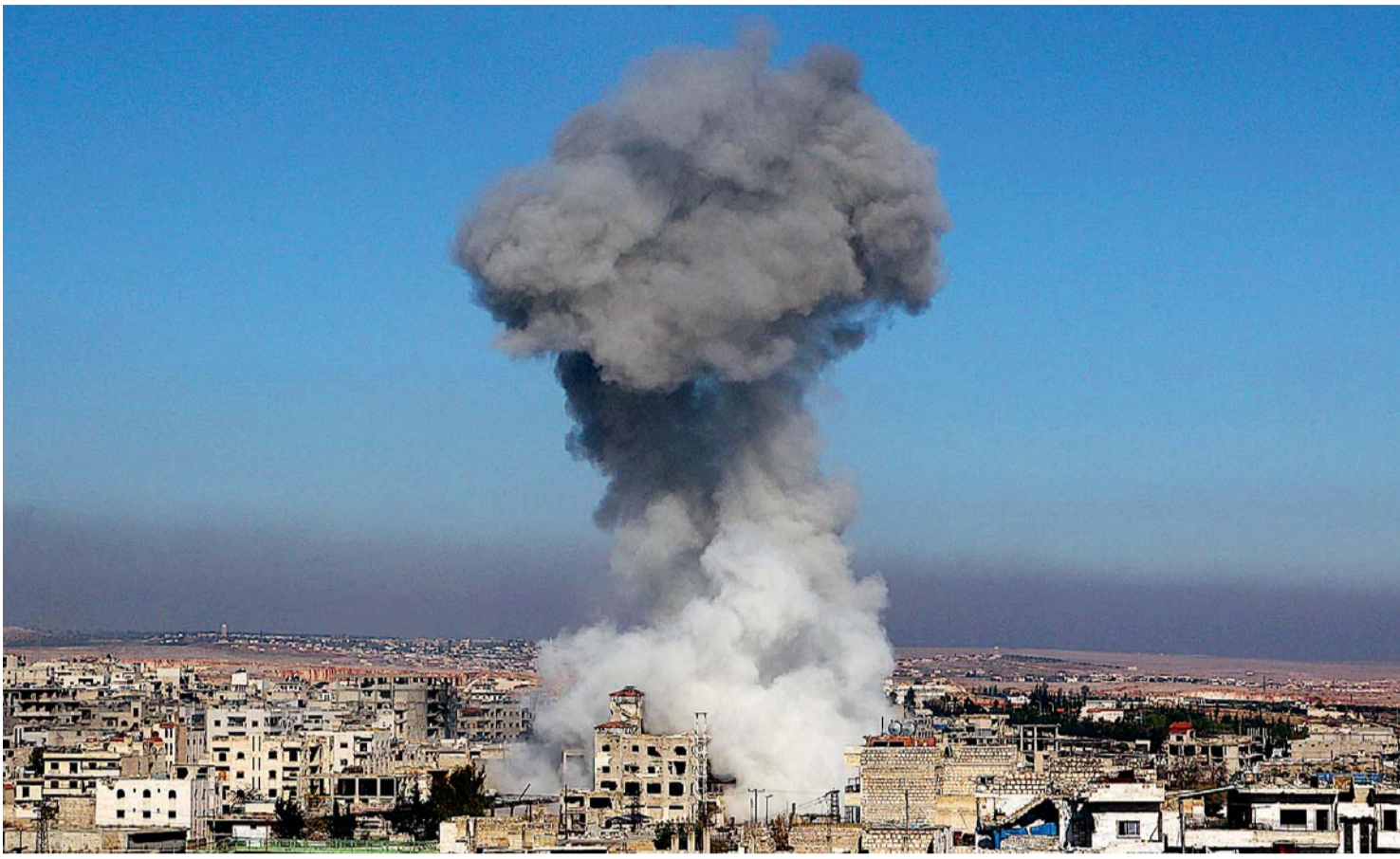
Smoke plume billows following a Syrian government air strike on a residential district of Maaret al-Numan in the northwestern Idlib province on Wednesday. 23 civilians have been killed in the air strikes and artillery fire in the northwest of the country.