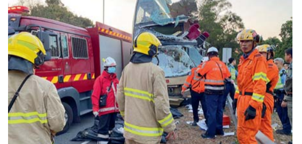
Firemen investigate a double-decker bus after its crash on a highway in Hong Kong on Wednesday.

Ottawa, Dec. 18: Privacy watchdogs have launched an investigation into a hack of health records, which a laboratory said may have compromised data on up to 15 million Canadians or nearly half the population. LifeLabs, which does blood work and other tests across Canada, said in a letter to customers that their names, contact information, health card numbers and lab test results were exposed in a cyber attack on its computers in early November. Most of those affected are in Ontario or British Columbia. The company also said it paid an undisclosed sum to the hackers to retrieve the data, and has retained experts to isolate and secure its affected computers.