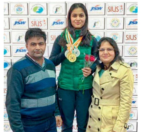
Manu Bhaker (centre) is flanked by her parents after winning gold in the junior women's 25m pistol at the 63rd National Shooting Championship Competitions (63rd NSCC) for rifle pistol in Bhopal on Wednesday.