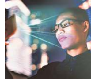
China seeks to leverage AI as facial recognition technology gains traction.

A China Unicom customer service representative told