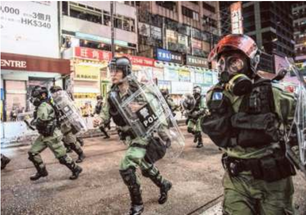
Face-off: Police running towards protesters on Nathan road in Hong Kong on Sunday.