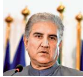
Shah Mahmood Qureshi

The visiting Pakistan Foreign Minister will also meet his Sri Lankan counterpart, Foreign Minister Dinesh Gunawardena. “The two sides will exchange views on the entire gamut of bilateral relations and matters pertaining to regional and international issues,” said a statement