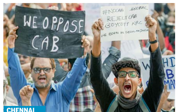
CHENNAI Protestors hold placards during a demonstration against the Citizenship Amendment Act in Chennai on Thursday.