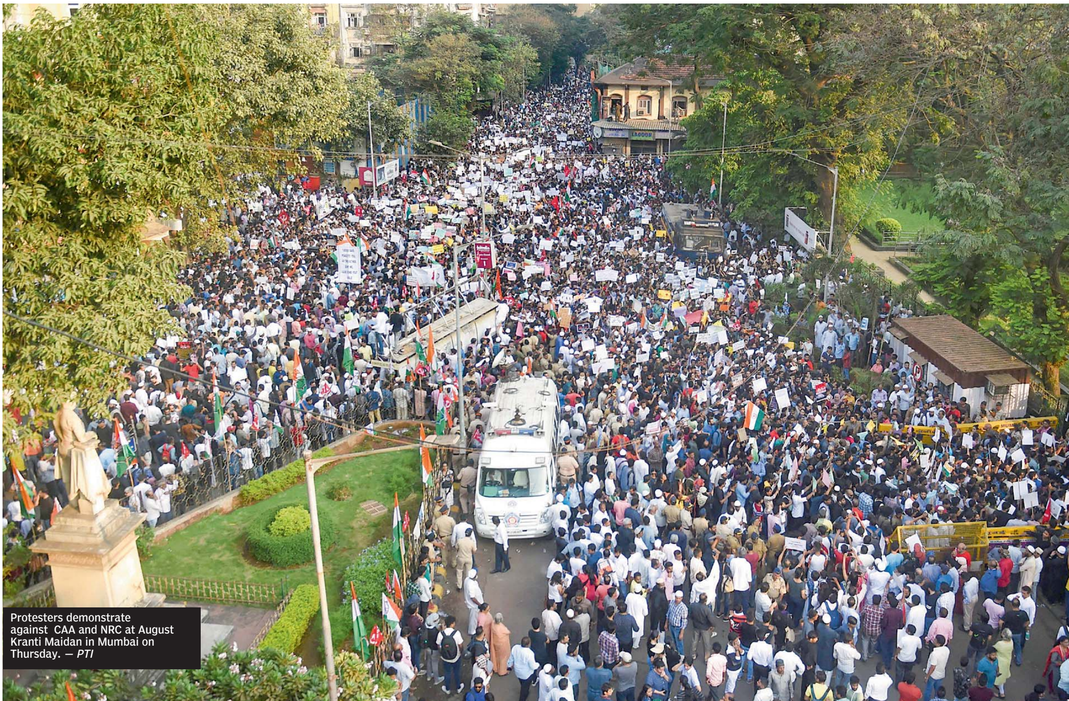
Protesters demonstrate against CAA and NRC at August Kranti Maidan in Mumbai on Thursday.

Citizens across India defy bans, face crackdowns to protest against CAA, NRC