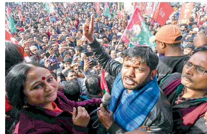
CPI leader Kanhaiya Kumar addresses a gathering during Bihar bandh against CAA and NRC in Patna on Thursday.