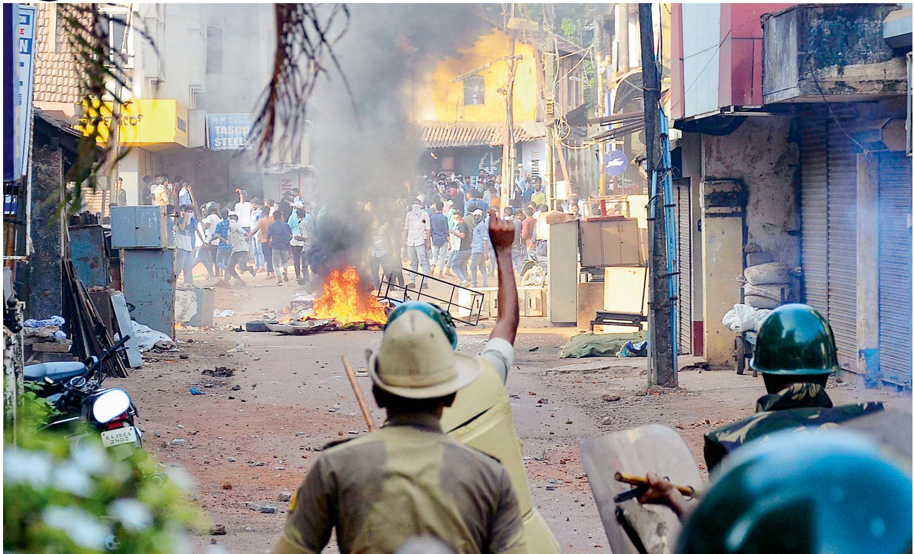
Police personnel pelt stones during their clash with the protesters participating in a rally against the amended Citizenship Act and the NRC in Mangaluru on Thursday. Two persons were killed in police firing as protests turned violent.

8 pm Police declare that the two injured have died