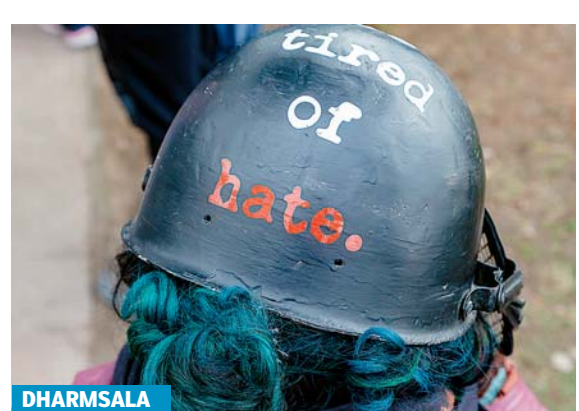
DHARMSALA A woman wears a helmet with the words “The World is Tired of Hate” as she participates in a gathering protesting the CAA in Dharmsala on Thursday.