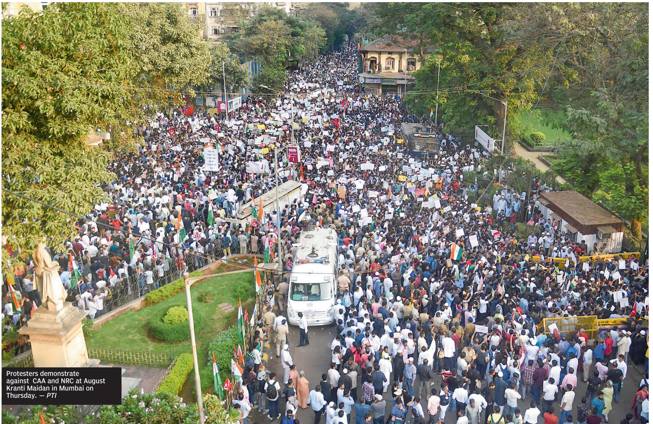
Protesters demonstrate against CAA and NRC at August Kranti Maidan in Mumbai on Thursday.

Citizens across India defy bans, face crackdowns to protest against CAA, NRC