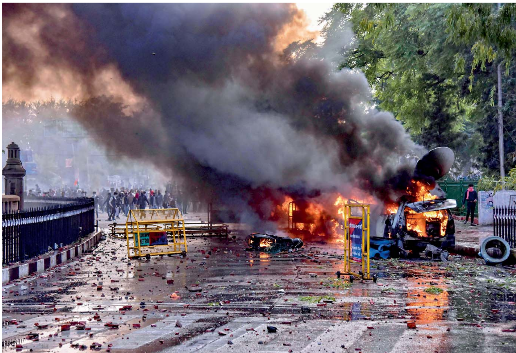
Smoke billows from a burning media OB van during a protest against the NRC and the Citizenship Amendment Act at Parivartan Chowk in Lucknow on Thursday. Defence minister Rajnath Singh later held a telephonic conversation with Uttar Pradesh Chief Minister Yogi Adityanath in the wake of incidents of violence in the state.

CPI general secretary D. Raja said citizenship cannot be based on religion. "The BJP is working against the legacy of Sardar Patel and citizenship cannot be based on religion. The CAA is an undeclared subversion of the Constitution," he claimed.