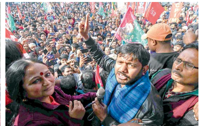
CPI leader Kanhaiya Kumar addresses a gathering during Bihar bandh against CAA and NRC in Patna on Thursday.