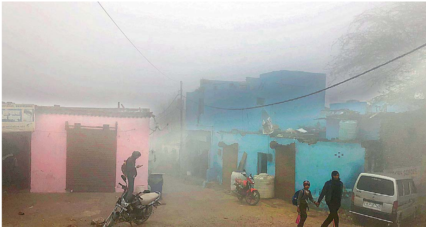
A man walks his son to the school, as another checks his mobile surrounded by morning fog in New Delhi on Thursday. Dense fog disrupted air and road traffic in and around the country's capital. Cold wave tightened its grip on northern states on Thursday as the mercury continued its downward spiral.

Drass - 14.4°C Srinagar - 2.3°C Jammu 8.6°C Jaipur 5.8 °C Delhi 5.2°C Manali 1°C Shimla 6.5°C Chandigarh 9.9°C