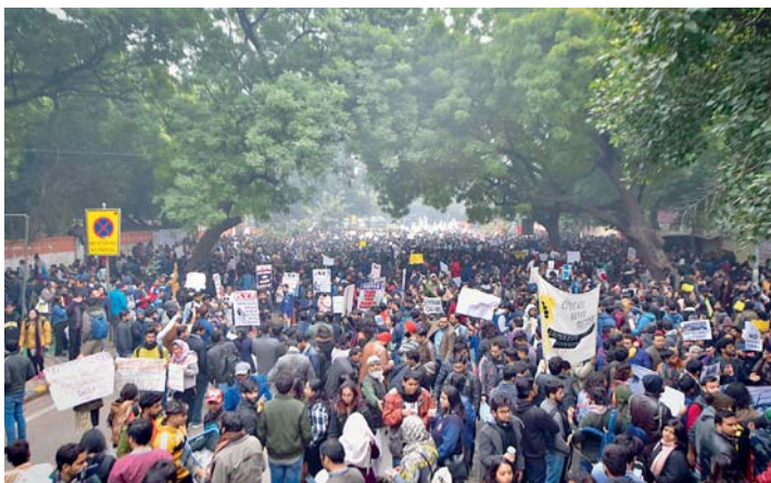
Protesters participate in a demonstration against the Citizenship (Amendment) Act, at Mandi House in New Delhi on Thursday.