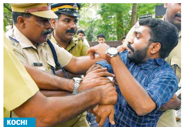
KOCHI A protester being detained by cops during a rally against the CAA in Kochi on Thursday.

Observers point out that the current Afghan government led by Ghani is extremely friendly to India and there are fears that the Citizenship Amendment Act controversy may cause some misunderstanding in the ties since Afghanistan is one of the countries mentioned in the amended law.