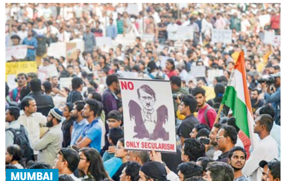
MUMBAI Protesters warned of the ill-effects of the CAA through