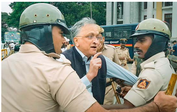
Historian Ramachandra Guha being detained by police during a protest against CAA at Town Hall in Bengaluru on Thursday.