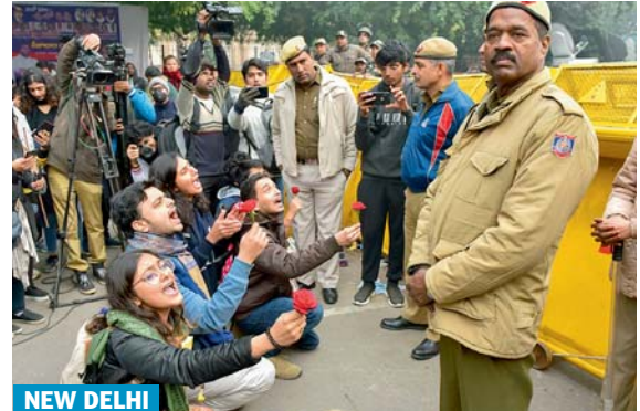
NEW DELHI Protesters offer roses to police personnel during a demonstration against the CAA at Mandi House in New Delhi on Thursday.