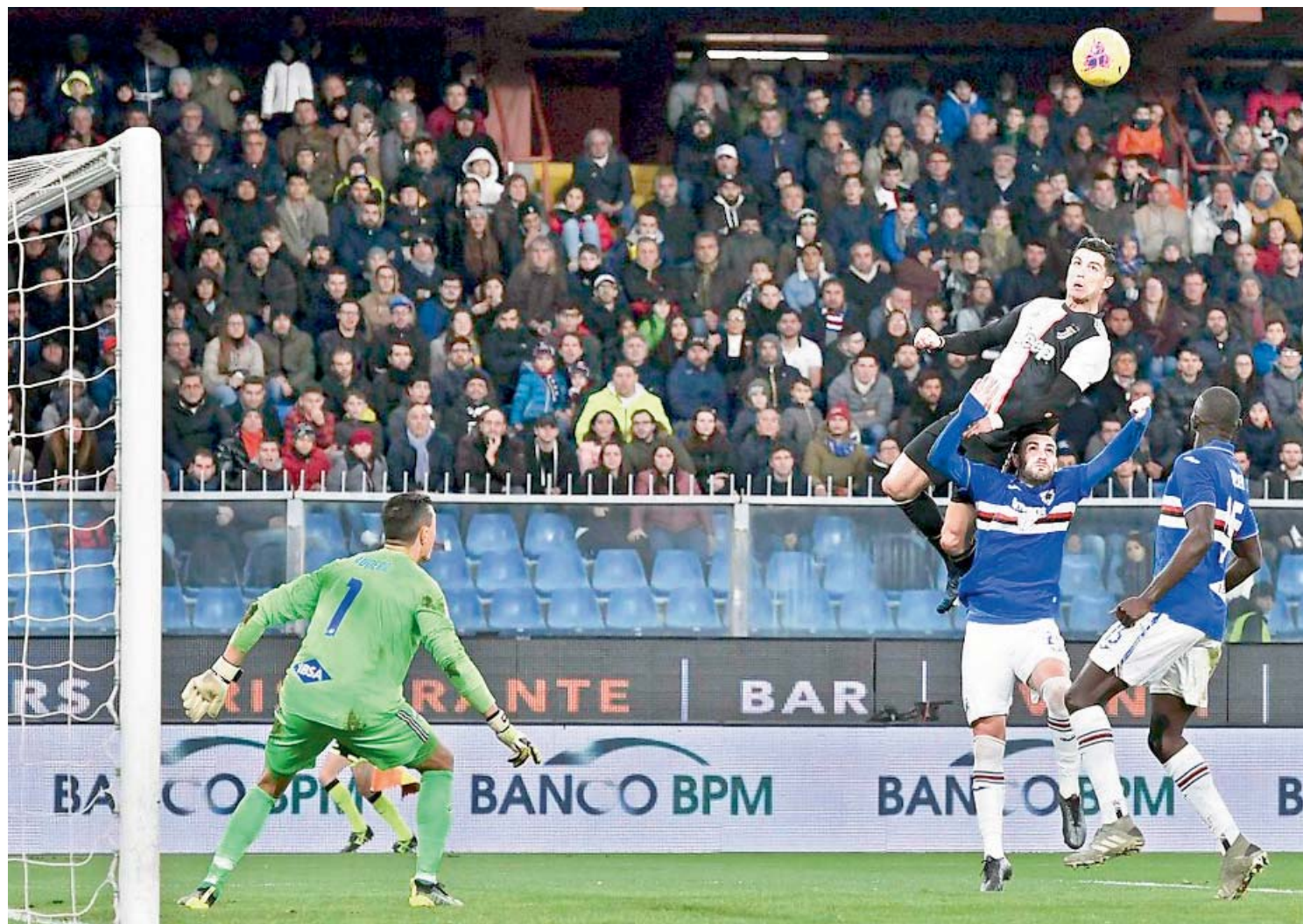
Cristiano Ronaldo jumps two-metre high to score the second goal for Juventus during their Italian league match against Sampdoria at the Luigi Ferraris stadium in Genoa, Italy, on Wednesday. Juventus won 2-1.

However Ronaldo soon sparked into action, first fizzing in a cross that both Gonzalo Higuain and Dybala just only just failed to get contact on. The Portugal forward then put the away side back in front in the final minute of the half with his sixth goal in five matches in all competitions, a hanging header from another pinpoint Sandro cross.