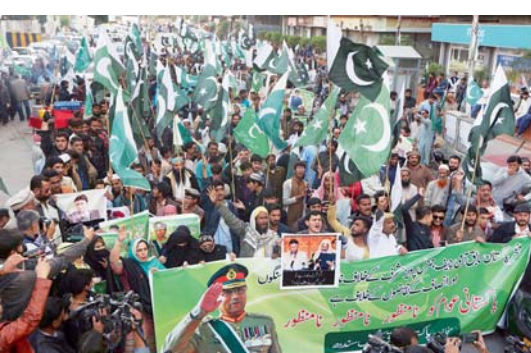
Supporters of former Pakistani military ruler Gen. Pervez Musharraf protest a court's decision to award him the death sentence, in Karachi, Pakistan, on Thursday.

Inter-Services Public Relations (ISPR) director general Major General Asif Ghafoor said the reservations expressed by the Pakistan Army over