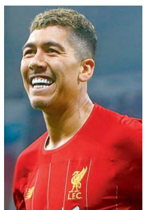
Liverpool's Roberto Firmino celebrates after scoring a goal during their Club World Cup semifinal against Monterrey at the Khalifa International Stadium in Doha, Qatar, on Wednesday. Liverpool won the game 2-1.