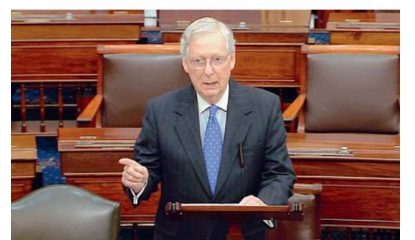
Majority Leader Mitch McConnell speaks at the US Capitol in Washington, DC on Thursday.

The Russian economy had suffered a double blow of a drop in global oil prices and Western sanctions that followed Moscow's 2014 annexation of Crimea. It has seen a slow recovery since 2017 after a two-year stagnation. Russia's ties with the West have remained at post-Cold War lows.