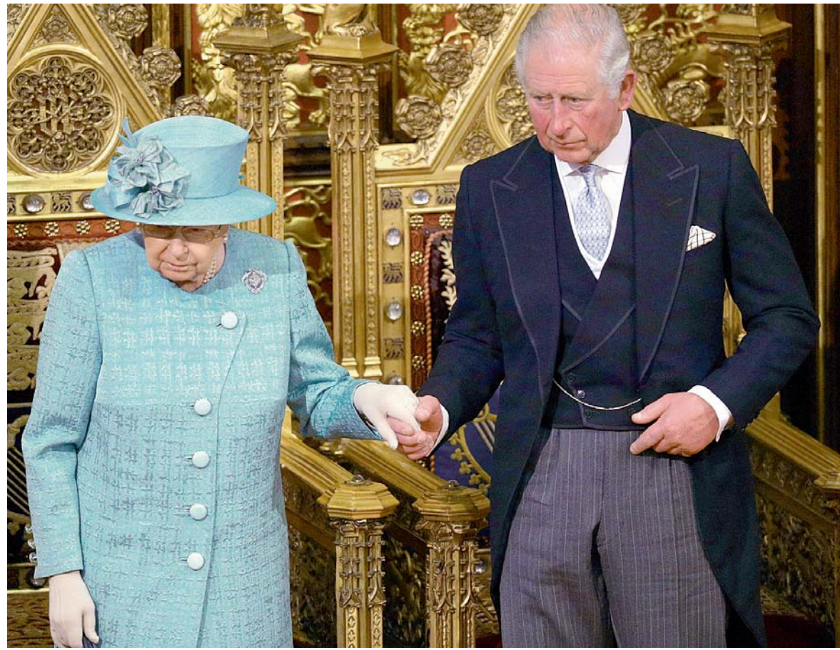
Britain's Queen Elizabeth II and the Prince of Wales leave the chamber after the State Opening of Parliament by the Queen, in the House of Lords, in London on Thursday.

The government also plans to pass several other Brexit-related measures, including a new "points-based" immigration system that will be introduced after Brexit, when EU citizens will lose the automatic right to live and work in the UK. Johnson also promised "an ambitious programme of domestic reform," including a law committing the government to spend more on the National Health Service,