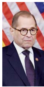
The president had been given the opportunity to come and testify before the Judiciary Committee, He declined to do so.

— JERRY NADLER, chairman of the Judiciary Committee,