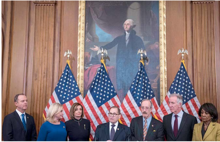
House committee on the judiciary chairman Jerry Nadler delivers remarks on Trump's impeachment alongside chairman Adam Schiff, chairwoman Carolyn Maloney and Speaker of the House Nancy Pelosi, on Thursday.

"Trump now always becomes part of the conversation about misusing presidential power. Ukraine will be his Watergate. Ukraine will be his Lewinsky." History books will add Trump to the section that features Bill Clinton, impeached 21 years ago for lying under oath about having sex with White House intern Monica Lewinsky, and Andrew Johnson, impeached 151 years ago for defying Congress on Recon-