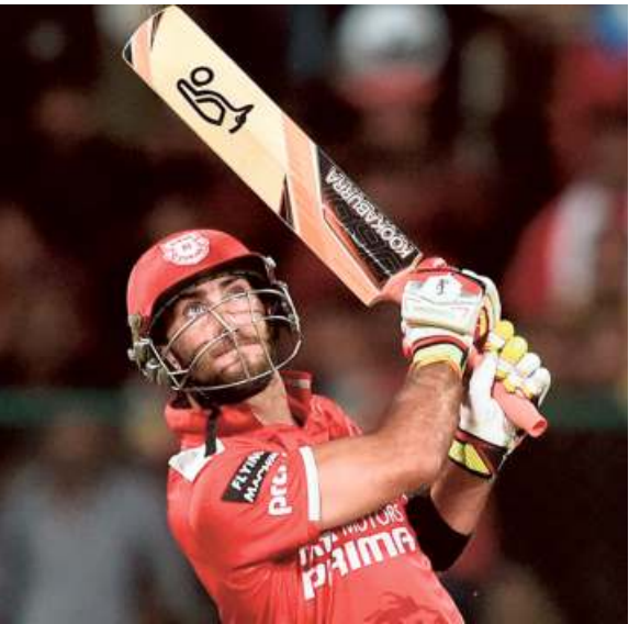
What a player! Maxwell's innings drew appreciation from Kings XI Punjab, his new IPL team.

read an Arsenal statement. "Mikel, a former club captain, played for us for five seasons from 2011 to 2016 and has signed a three-and-a-half year contract."