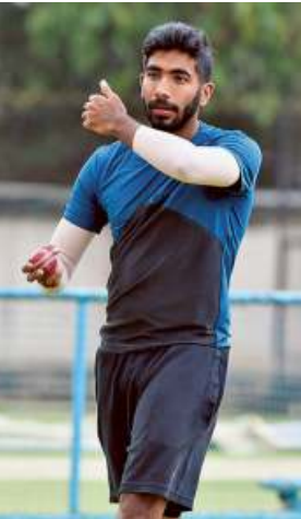
Jasprit Bumrah.

A source, clued into the academy's process, emphatically said: "At no stage we refused Bumrah at NCA. We only said that 'look if you have been treated by somebody else for the last four months and someone else knows your case, how can we conduct a test and pass you fit?' In fact, Bumrah was offered to use the NCA facilities. He was told to get whoever he wanted and do the test here. Last minute you land up and ask us to conduct a fitness test means (but) how can we? Nobody knows his case. NCA trainers have not trained with him