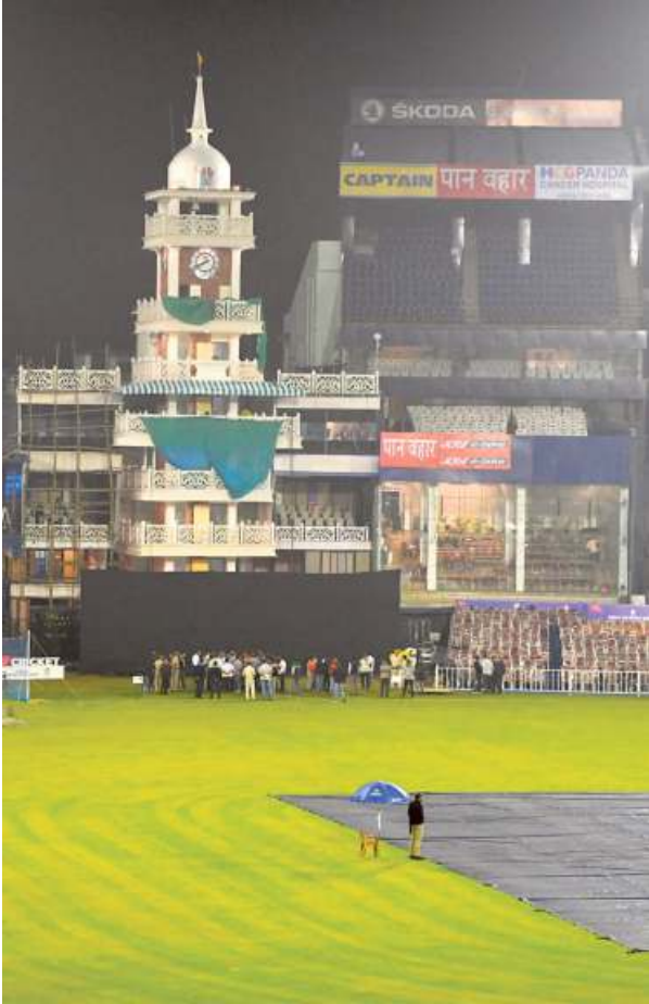
Setting it right: The iconic clock tower at the Barabati Stadium was renovated and given a more aesthetic look.

wicket with Niroshan Dickwella (21) and then another 51 with Perera for the eighth.