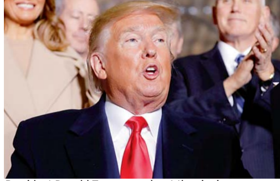
President Donald Trump speaks at the signing ceremony for S.1709, The National Defense Authorization Act for Fiscal Year 2020 in Joint Base Andrews, Maryland. (Right), US House Speaker Nancy Pelosi.

"Nancy Pelosi is looking for a Quid Pro Quo with the Senate. Why aren't we impeaching her?" Trump tweeted, mocking one of the accusations against him before heading out for