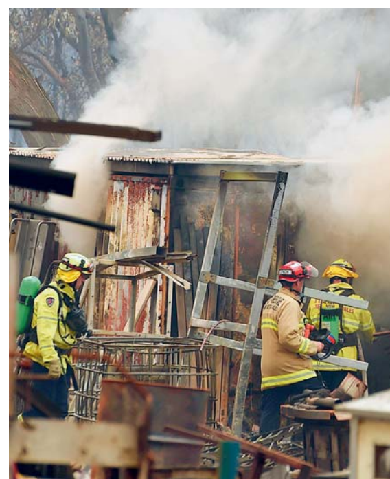
(From top), Sunbathers are seen on Bondi Beach as temperatures soar in Sydney. The picture above shows firetrucks stationed on a road as a bushfire burns in Bargo, southwest of Sydney. (Right), Firefighters tend to burning property caused by bushfires in Bargo.