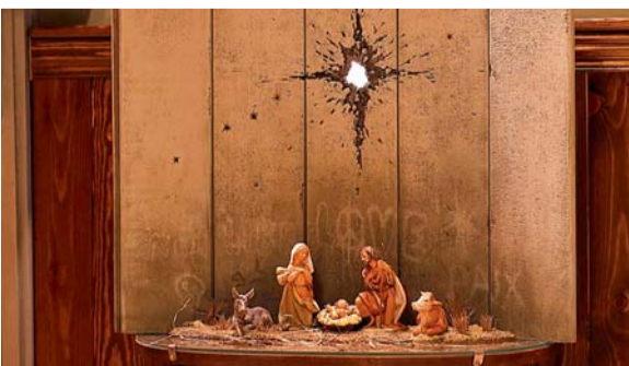
A peek into the 'Scar of Bethlehem' artwork by Banksy displayed in Bethlehem.

week at the church built on the spot where Christians believe Jesus was born. The manger scene and hotel — an establishment opened two years ago — are far from Banksy's only West Bank imprint. In 2007, he painted a number of artworks in Bethlehem, including a young girl frisking an Israeli soldier pinned up against a wall. In 2005, he sprayed nine stencilled images at different locations along the eight-metre-high (27-foot) separation barrier. They included a ladder