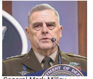
General Mark Milley

Negotiations over North Korea's nuclear programme have been deadlocked since a summit in Hanoi collapsed in February. — Reuters