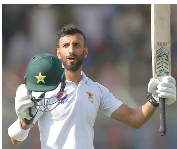
Pakistan's Shan Masood celebrates his century against Sri Lanka during the third day of their second Test at National Stadium in Karachi, Pakistan, on Saturday.

Karachi, Dec 21: Abid Ali and Shan Masood became only the third opening pair for Pakistan to hit centuries in the same innings as Pakistan turned the tables on Sri Lanka in the second and final Test in Karachi on Saturday.