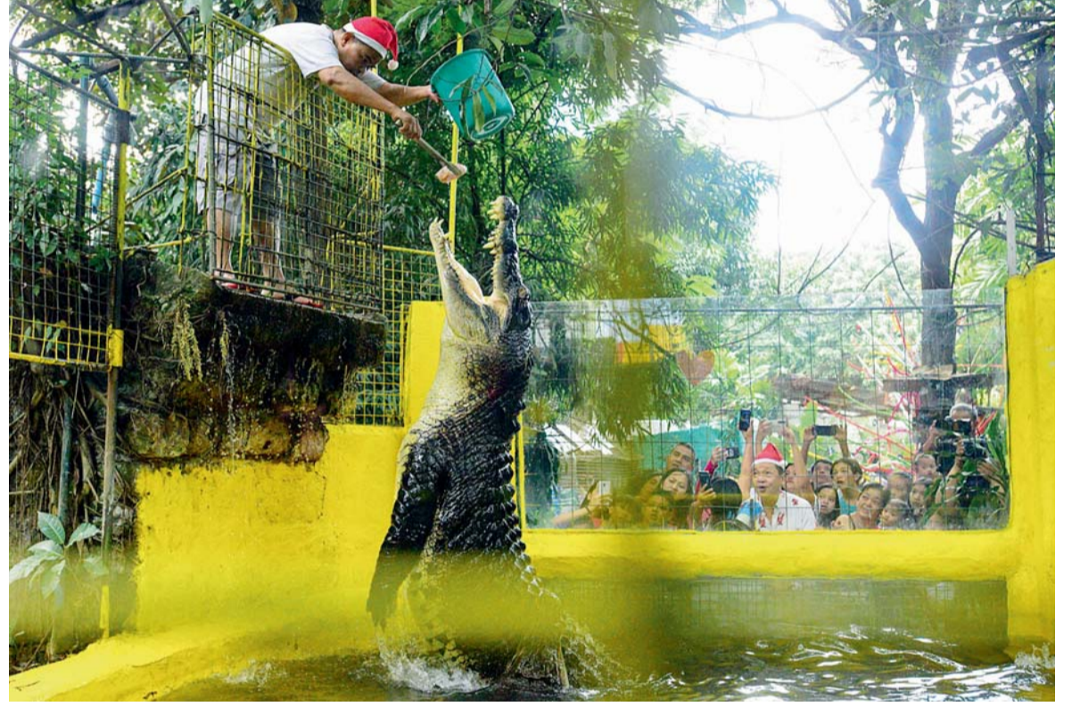
A worker feeds a crocodile named Lolong 2 at an enclosure during the 'Animal Christmas Party', where children were treated to a tour of the Malabon Zoo, in Manila.