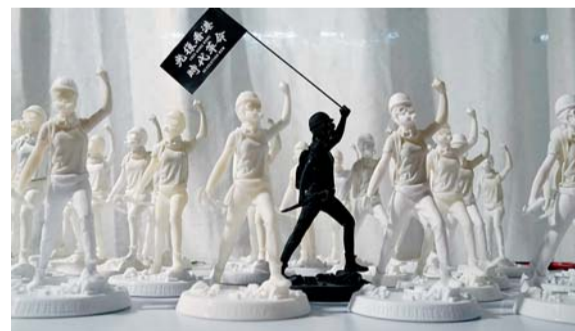
Figures named 'Lady Liberty Hong Kong', inspired by the outfit of anti-extradition law protesters with yellow helmets, goggles, gas masks and umbrellas, on display at a studio in Hong Kong. — AP

They were initially sparked by a now-abandoned attempt to allow extraditions to the authoritarian mainland but have since morphed into a popular revolt against Beijing's rule, with spiralling fears that the city is losing some of its unique liberties. — AFP