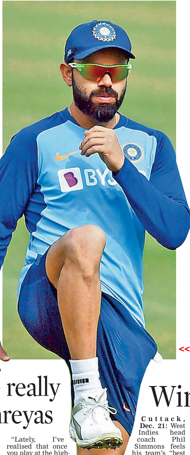
Virat Kohli during a training session at Cuttack on Saturday.

The fielding, though, has failed to match the high standards India have set in recent years. While Iyer's effort to dismiss Shimron Hetmyer was eye-catching, Chahar dropped a sitter off Nicholas Pooran and grassed Shai Hope for a duck at the slip cordon, something that attracted Kohli's attention.