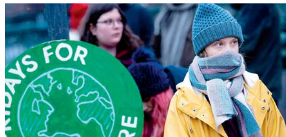
Greta Thunberg attends a climate strike arranged by the organisation Fridays For Future outside the Swedish parliament Riksdagen in Stockholm.

Stockholm, Dec. 20: After months of criss-crossing the Atlantic to attend first the UN climate summit in New York and then COP25 talks in Madrid, teenage eco-warrior Greta Thunberg was back in Sweden on Friday, taking part in a rally outside the parliament where her protests first began over a year ago. Dressed in her trademark yellow sou'wester and woollen hat and trailed by a pack of bodyguards, Thunberg met with a group of young climate activists just outside the parliamentary building. Named 2019 Person of the Year by Time magazine, Thunberg said she hoped the distinction would help put her cause in the spotlight. "I really hope that it raises awareness and motivates others to get involved in the campaign," she told Swedish news agency TT. Just over a year ago, at the start of the school year, the then-ninth grade student left her books at home and began sitting outside the Swedish parliament to raise awareness about the climate emergency.