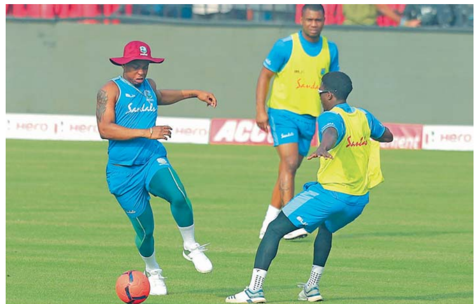
West Indies players during a training session at Cuttack on Saturday.

The gulf between the two sides has progressively widened in the last decade or so as the West Indies, barring their 3-0 sweep over Afghanistan last month, have gone without a win in 16 bilateral ODI series since August 2014. "The thing is we are trying to build something and the game tomorrow does not influence the direction in which we are going... But we are trying to build something and will continue to be in direction we are going."