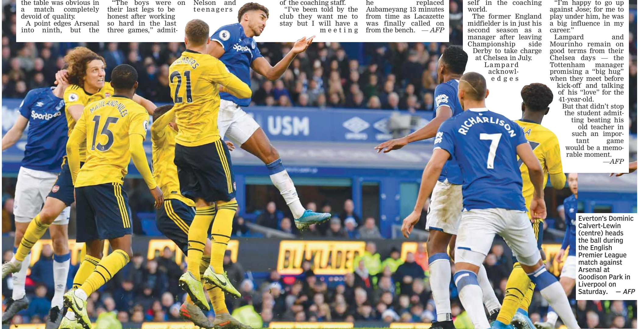
Everton's Dominic Calvert-Lewin (centre) heads the ball during the English Premier League match against Arsenal at Goodison Park in Liverpool on Saturday.

Ljungberg's final decision of his caretaker spell was a brave one as he replaced Aubameyang 13 minutes from time as Lacazette was finally called on from the bench.