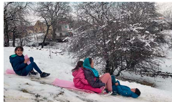
Migrant children play in the snow by a disused ski lodge in Grevena, Thessaloniki. The facility hosts asylum-seekers from Somalia. — AFP

when carbon dioxide levels in the atmosphere were getting lower and temperatures were dropping, Stein said. By studying the cooling process, it could be possible to better understand the relationship today between climate warming and deforestation, since it may be a similar process in reverse, he said. — AFP