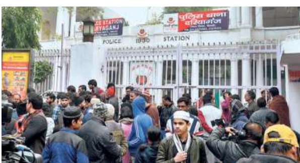
Relatives of those arrested in connection with Friday's violence at the Daryaganj police station on Saturday.