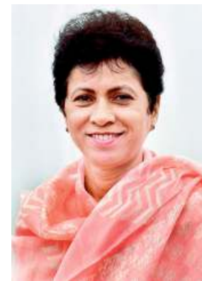
Kumari Selja.

"Instead of bringing in investment and opening new industries in the State in the last five years, the industries