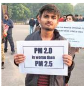
A man with a placard during the protest against CAA at Leisure Valley Park on Saturday.