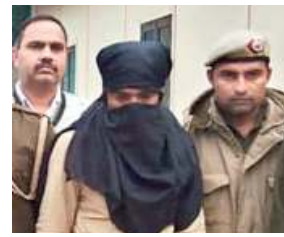
The accused in police custody.

She also said he had threatened to kill the boy if she did not accept his