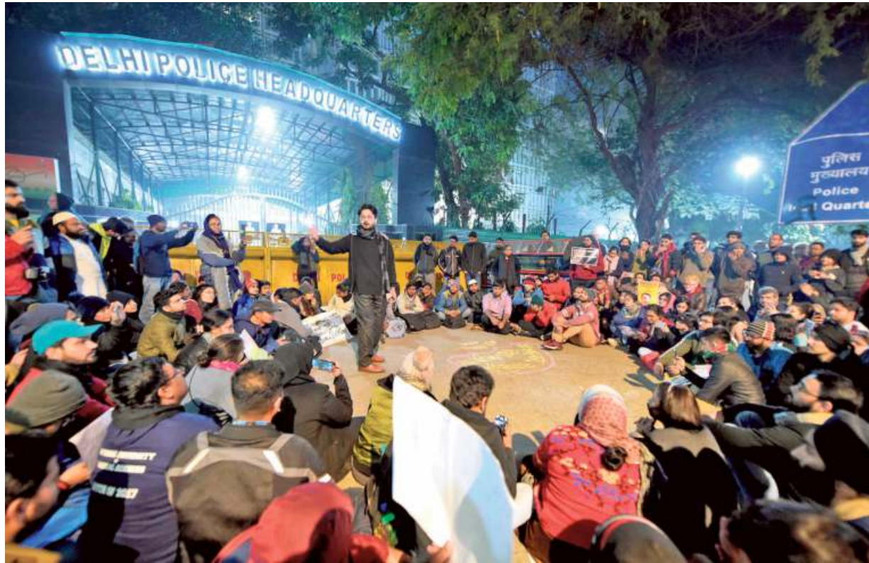
For the second consecutive day, hundreds of students and citizens assembled outside the Delhi Police headquarters at ITO on Saturday to condemn police brutality and demand the release of those detained for protesting against the Citizenship (Amendment) Act and the National Register of Citizens. ■PTI