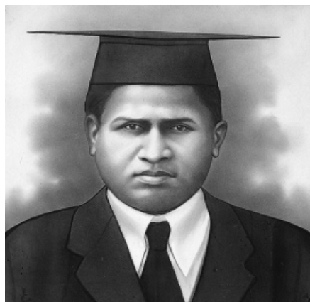
Still relevant: Srinivasa Ramanujan's mathematics now finds applications in areas not known during his lifetime.