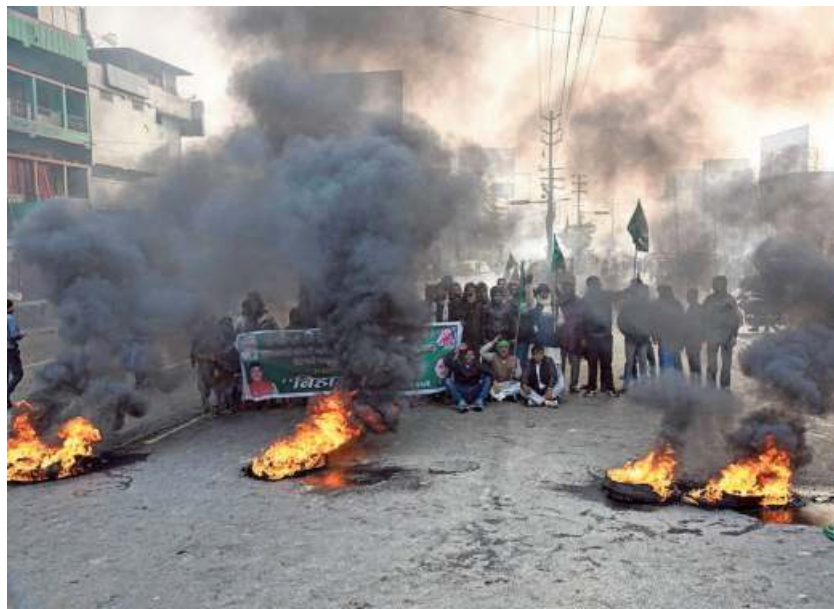
Fury rages: Protesters blocking a road by burning tyres during a bandh in Patna; a man displaying a poster during a demonstration at the Rajghat in New Delhi, and the police cornering a protester in Varanasi on Saturday.