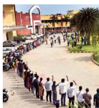
A protest against the CAA by students of Pondicherry University.