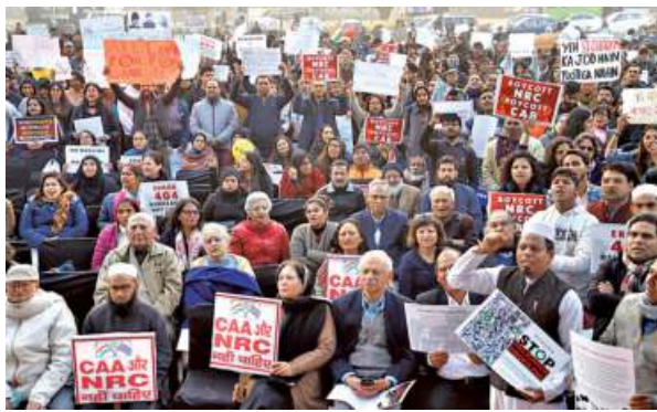
Citizens during the protest at Leisure Valley Park in Sector 29, Gurugram, on Saturday.