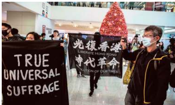
In black and white: Protesters marching through a mall in the Tsim Sha Tsui district of Hong Kong on Saturday.