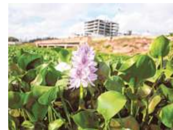
Waste to wealth: Water hyacinth was used to produce carbon nanoparticles. • M. KARUNAKARAN

In an extraordinary waste-to-wealth feat, researchers from Assam have used the commonly found invasive plant water hyacinth to produce carbon nanoparticles. These extremely tiny (less than 10 nanometre) particles can be used for detecting a commonly used herbicide – pretilachlor. The nanoparticles were found to be selective and sensitive for the detection of the herbicide.