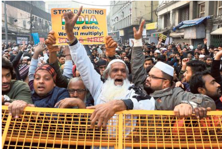
Thousands protested against the Citizenship (Amendment) Act and the National Register of Citizens at Daryaganj near Delhi Gate on Friday.