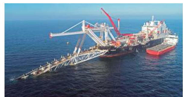
Sea tensions: The Audacia ship belonging to an Allseas offshore service company, which is responsible for laying parts of the Nord Stream 2 pipeline in the Baltic Sea.

U.S. lawmakers have warned that the pipeline would enrich a hostile Russian government and vastly increase President Vladimir Putin's influence in Europe. Both houses of Congress overwhelmingly approved the sanctions, with the Se-