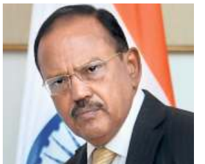
Ajit Doval and Chinese team agreed to intensify efforts to resolve the border issue.

A statement issued by the Chinese embassy on the talks said the two countries are planning 70 events to celebrate the 70th anniversary of diplomatic ties next year. The statement added that the two sides would "actively advance boundary negotiations in line with the Agreement on the Political Parameters and Guiding Principles for the