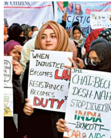
Students and citizens protest against the amended Citizenship Act outside Jamia Millia Islamia; (right) volunteers hand out food to the protesters on Saturday.