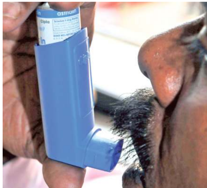
Inherited: All 14 family members with asthma had one copy of the gene variant