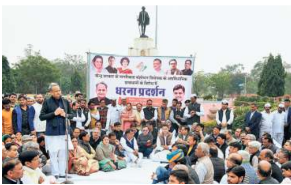
Rajasthan CM Ashok Gehlot, Deputy CM Sachin Pilot and other Congress leaders at a rally in Jaipur.

Mr. Gehlot told reporters on Saturday that the members of all communities, taking part in the march, would