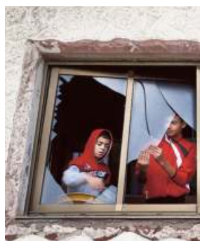
A home in Gaza City that was damaged following an Israeli attack on December 8.

She said that before opening a full probe, she would ask the ICC to rule on the territory over which it has jurisdiction because of the "unique and highly contested legal and factual issues attaching to this situation." "Specifically, I have sought confirmation that the 'territory' over which the Court