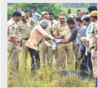
Forensic experts collecting evidence from the spot where police shot dead four accused at Shadnagar.

Sequence of events after four accused in the Disha case were shot dead by the police