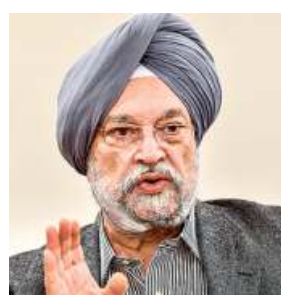
Housing and Urban Affairs Minister Hardeep Singh Puri.

The plot is opposite Parliament House, with Red Cross Road to its north, Raisina Road to its south and