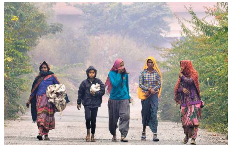
Labourers on their way to work on a cold Saturday morning near Yamuna Pushta.

poor families, he alleged. "Under the PM Awas Yojana, 3.5 crore people have been provided houses till date but the poor people of Delhi have not been included in this scheme because it was not implemented here," he said, adding: "Arvind Kejriwal must answer why he is doing such injustice with the poor people?"