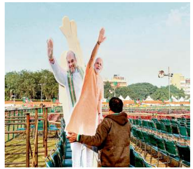
A worker carries cut-outs of PM Narendra Modi and Home Minister Amit Shah at Ramlila Maidan on Saturday.

He added: "Previously, the Congress governments kept this work pending for 15 years and now the Chief Minister deliberately kept it