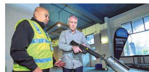
Arms handed over: New Zealand police officers with a firearm ahead of a gun buyback scheme in Upper Hutt in July.

The government banned the most lethal types of semi-automatic weapons less than a month after a lone gunman in March killed 51 worshippers at two Christchurch mosques. The police then launched a six-month