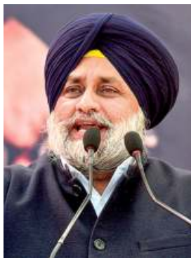
Sukhbir Singh Badal. ■ FILE PHOTO

"At the behest of Congress leaders, illegal mining and business of illegal liquor and drugs are also rising and the local administration was turning a blind eye towards these activities," alleged Mr. Badal. He added that SAD would not allow the State government to take over 'Shamlat' land to hand it over to their favourites at throwaway prices.