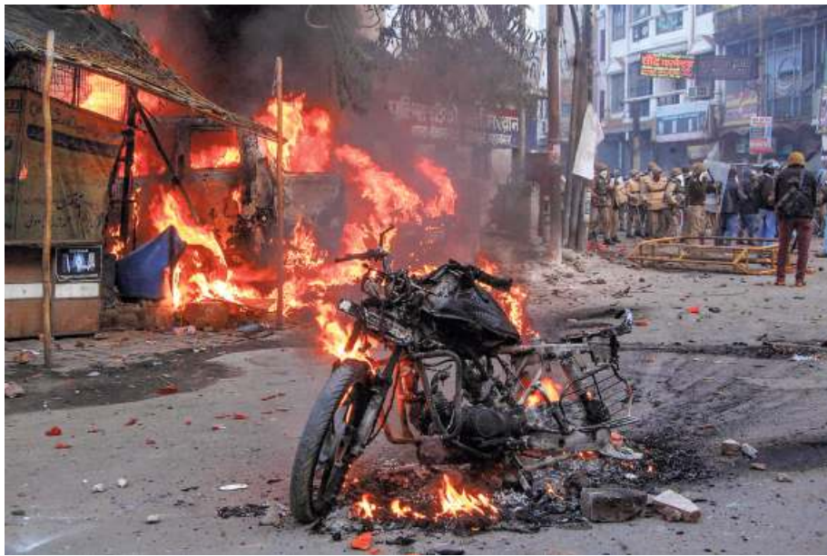
Fiery agitation: A vehicle allegedly torched by protesters during a demonstration against the Citizenship (Amendment) Act in Kanpur on Saturday.