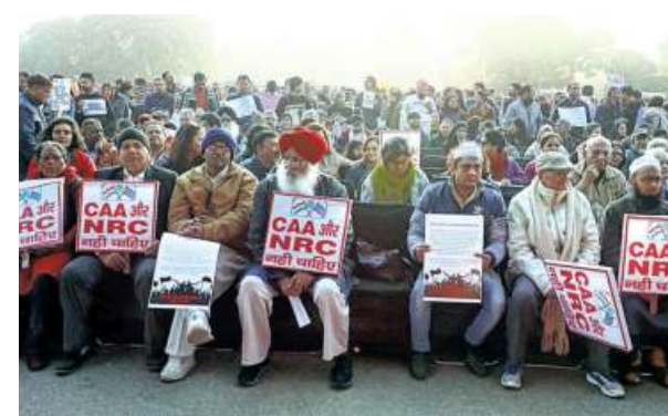
In solidarity: Residents of Gurugram came together to protest against the CAA and the NRC on Saturday.

The police lathi-charged the crowd and fired tear-gas shells. "At other places in the city, we could control the crowd with the help of Ulemas, but at Chauraha Hathi Khana, the protesters put teenagers in the front who were throwing sutti bombs at the police. They also tar-