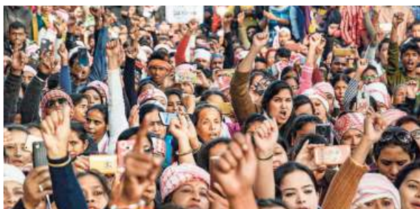
All Assam Students' Union activists raise slogans against the Citizenship (Amendment) Act in Nalbari on Friday.