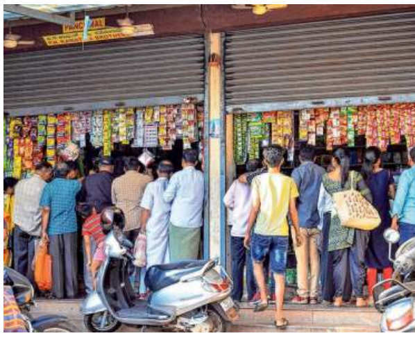
Some respite: Residents thronging a shop after curfew was relaxed in Mangaluru on Saturday.

Talking about the police firing that claimed two lives, Mr. Yediyurappa said that no one was happy with what had happened on Thursday, even as he defended police action. The police were "compelled" to use force to deter the surging crowds. "They tried to storm a police station," he said. The Chief