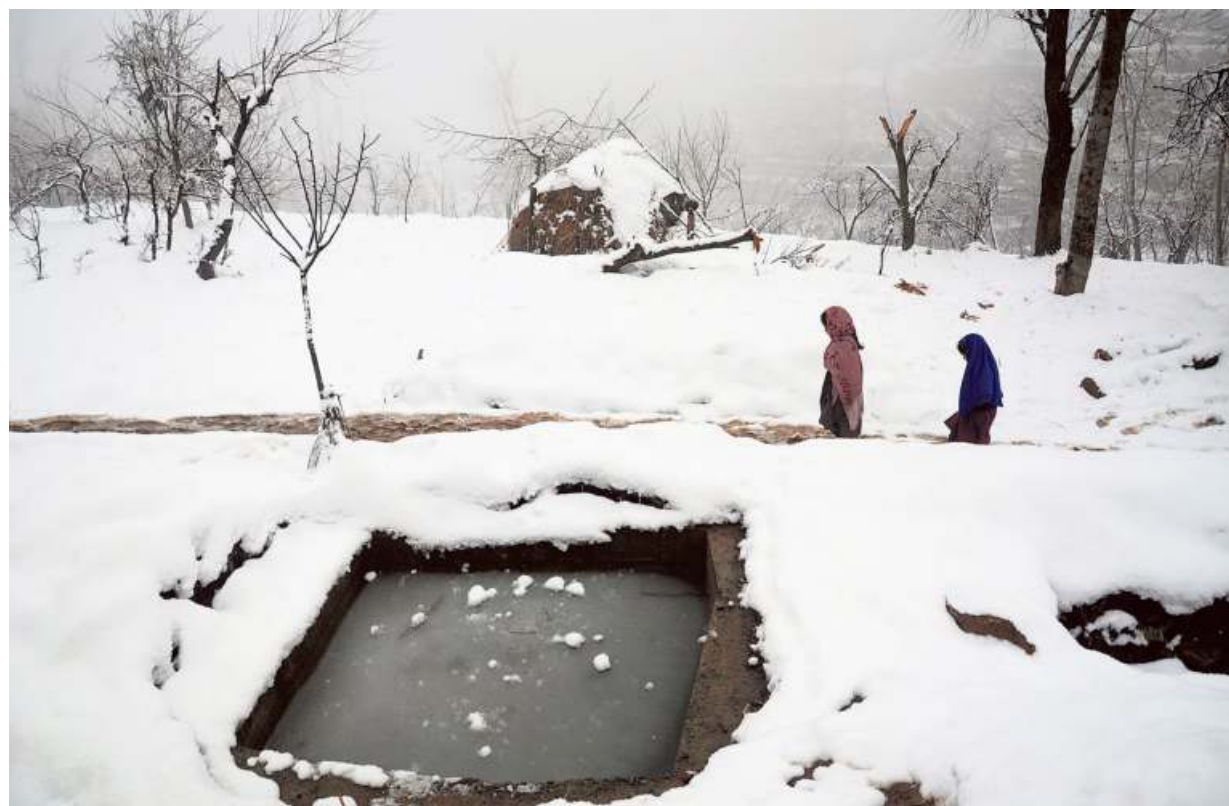
Winter blues: Women walking along a snow-covered road near Srinagar on Saturday. Many places in Kashmir recorded sub-zero temperatures at the start of 'Chillai-Kalan', the 40-day period when the winter is at its harshest.