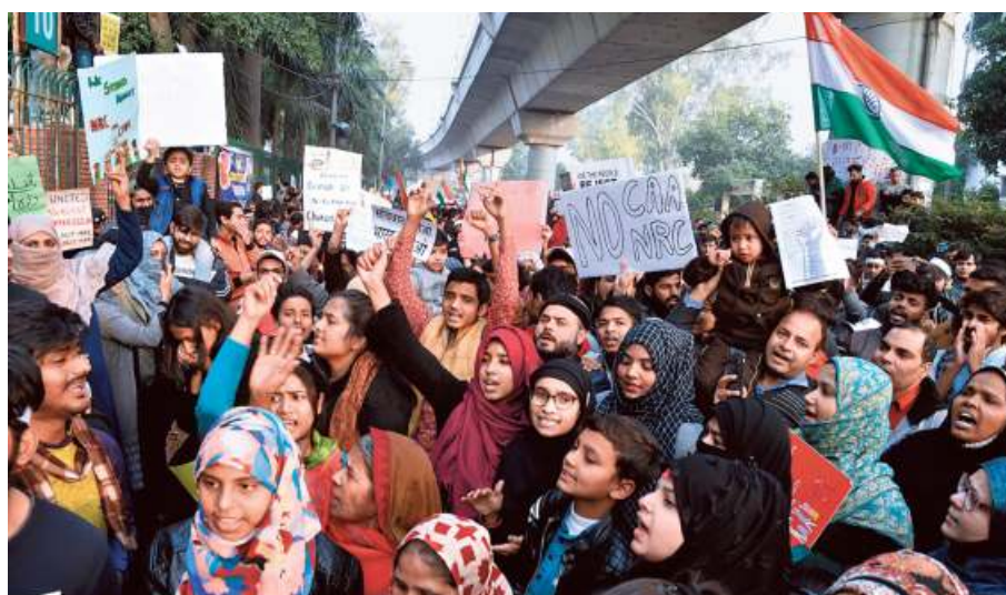
Catching fire: A gathering of about 50 students grew into a big protest outside the Jamia Millia Islamia campus in New Delhi on Saturday.