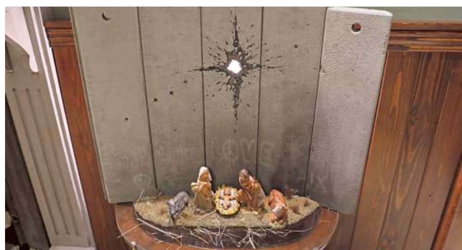
Art that makes you think: A new Christmas-themed artwork, dubbed the 'Scar of Bethlehem' and made by Banksy, at the Walled-Off Hotel in Bethlehem.

"Love" and "peace" are respectively graffiti tagged in English and French on the artistic installation's concrete blocks, while three large wrapped presents are