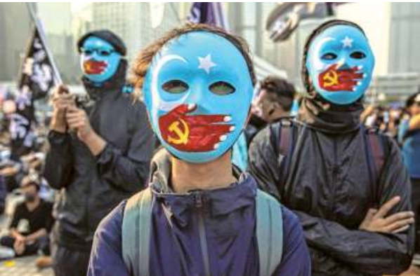
Show of solidarity: Protesters attending a rally in Hong Kong on Sunday to show support for the Uighur minority.

REUTERS HONG KONG Hong Kong riot police pepper sprayed protesters to disperse crowds in the heart of the city's financial district on Sunday after a largely peaceful rally in support of China's ethnic Uighurs turned chaotic. Dozens of police marched across a public square overlooking Hong Kong's harbour to face off with protesters who hurled glass bottles and rocks at them. Earlier in the afternoon more than 1,000 people had rallied calmly, waving Uighur flags and posters, as they took part in the latest demonstration in over six months of unrest. A mixed crowd of young