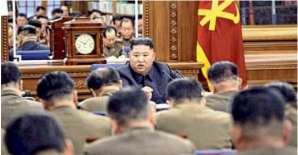
Taking stock: North Korean leader Kim Jong-un speaking during a ruling party meeting.

The North promised an ominous "Christmas gift" earlier this month if Washington does not give ground by the end of December. The denuclearisation process has been largely deadlocked since the collapse of a summit in Hanoi at the start of the year. Pyongyang has carried out a series of static tests at its Sohae rocket facility this month, after a number of weapons launches in recent weeks – some of them described as ballistic missiles by Japan and others. North Korea is banned from carrying out such tests under UN sanctions. Mr. Kim held an enlarged meeting of the ruling Workers' Party's Central Military