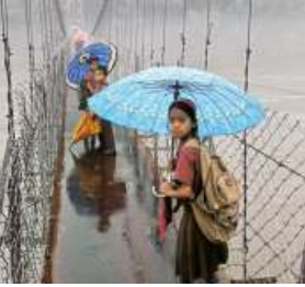
The teacher-student ratio is skewed in favour of urban centres in the State.

A government spokesperson said that under the new policy, all government schools will be divided into three categories — hard, medium and soft — based on topography, accessibility and degrees of difficulty in staying at the place of posting. "All new recruits will be given a hard posting for a mandatory three years, inclusive of their probation period.