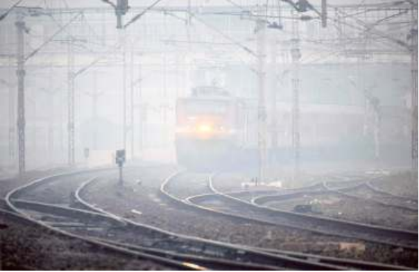
Tech upgrade: The new systems will reduce congestion and improve safety, line capacity and punctuality.

"We are yet to get approval for this [entire project] from