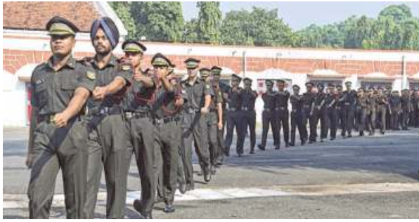
Lot of room: The OTAs are under-utilised because the intake has increased through other schemes.

Earlier, the Centre was supposed to build a new regimental Centre for the Sikh Light Infantry. The move is