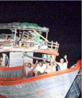
The people were held about 125 nautical miles east of Little Andaman.

A total of 250 packets weighing 1 kg each and 106