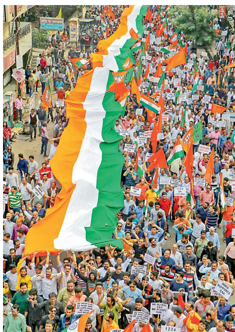
BJP, RSS, VHP, Bajrang Dal and various organisations take part in a rally in support of the Citizenship Amendment Act in Nagpur, on Sunday.

Defending the CAA, Mr Modi said that it is about giving rights to persecuted minorities from neighbouring countries and that does not snatch anybody's rights and asked people at his rally to stand up to show respect for the Parliament and lawmakers.