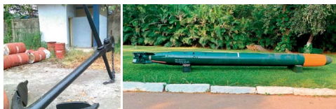
The 1.5-tonne anchor (left) and heavyweight torpedo (top) at the Hyderabad Public School-Begumpet.

The anchor and torpedo establish a presence for the Navy. Exhibiting decommissioned assets from the Army, Navy and the Air Force would play a vital role in motivating stu-