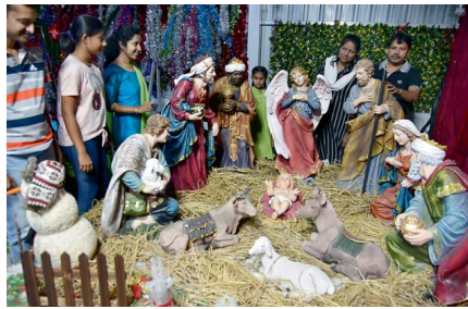
Shoppers look at a Nativity scene crib set at a shop in the city on Sunday, three days ahead of Christmas. With the Star being set up on buildings festooned with fairy lights, the city is getting set for Christmas.