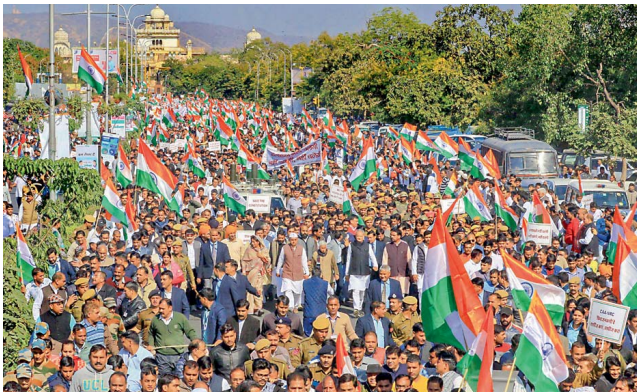
Rajasthan Chief Minister Ashok Gehlot leads three lakh protesters in Jaipur on Sunday against CAA and NRC.

Page 8: CAA has nothing to do with Indian Muslims: PM