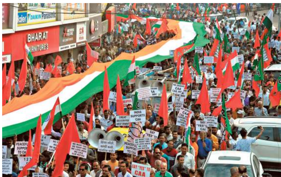
Dispelling the myth: BJP supporters taking out a rally organised by Lokadhikar Manch in support of the Citizenship (Amendment) Act in Nagpur on Sunday.

There have been anti-CAA protests across the country with several of them turning violent, leading to arson and damage to property. Under the new law, non-Muslim refugees who came to India before December 31, 2014, to escape religious persecution in Pakistan, Bangladesh and Afghanistan, will be granted Indian citizenship.