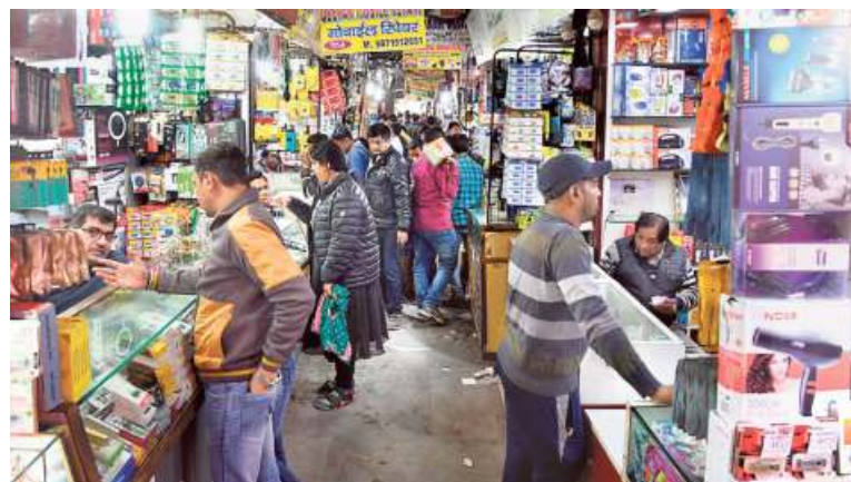
1 2 3 1,2 and 3: Shoppers in Sarojini Nagar Market 4 5 6 and 7 4 and 5: Sadar Bazar 6 and 7: Lajpat Rai Market 6 7 8 8: Bhagirath Palace Market in Chandni Chowk

Timings DELHI MONDAY, DEC. 23 RISE 07:10 SET 17:30 RISE 04:00 SET 15:17 TUESDAY, DEC. 24 RISE 07:11 SET 17:31 RISE 05:04 SET 16:01 WEDNESDAY, DEC. 25 RISE 07:11 SET 17:31 RISE 06:07 SET 16:50