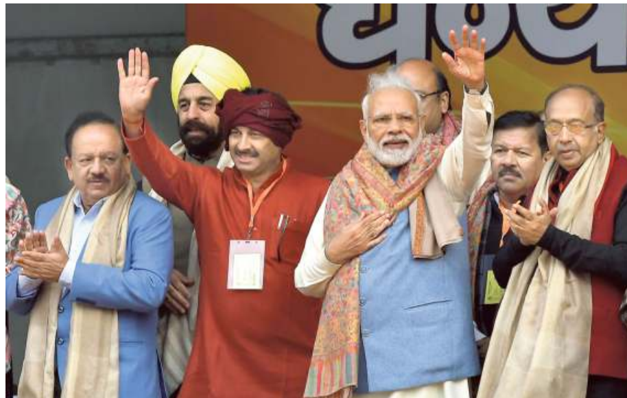
In campaign mode: PM Modi, along with BJP leaders Harsh Vardhan, Manoj Tiwari and Vijay Goel, at a rally in New Delhi on Sunday.

He attacked the Congress and "urban Naxals" for spreading "lies and rumours" about the NRC, the Citizenship (Amendment) Act (CAA) and detention centres for Muslims, and followed it up with an appeal to the youth to both read and read up on the NRC and the CAA. "The NRC - what lies are being spread about it... this [the NRC] was made during