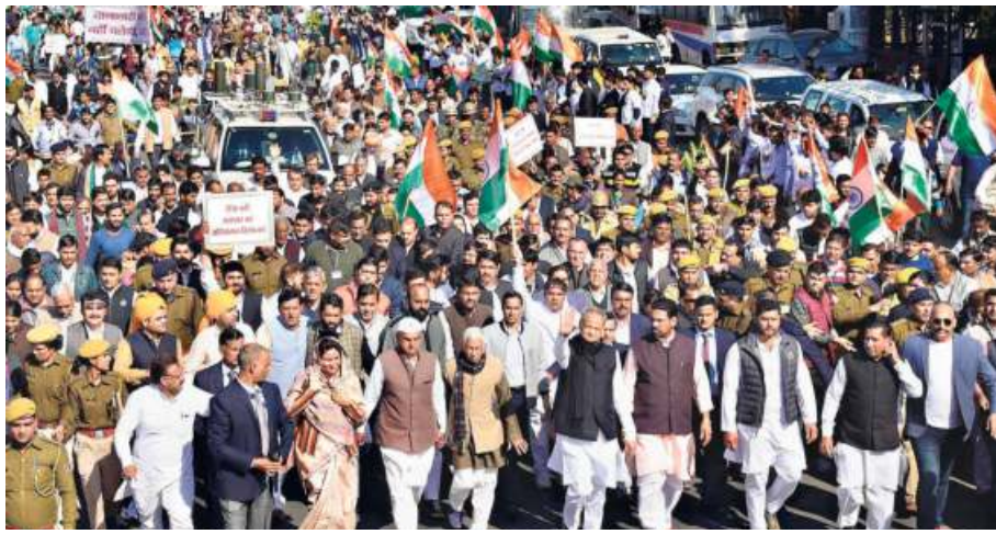
Chief Minister Ashok Gehlot leads a march against CAA in Jaipur on Sunday.

Besides Mr. Gehlot, leaders of the CPI, the CPI(M), the