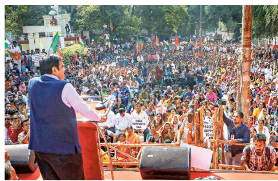
Allaying concerns: Union Minister Nitin Gadkari addresses a rally in support of the Citizenship Amendment Act in Nagpur on Sunday.

He said the government's only concern is foreign intruders living in the country. The minister said Muslims should understand that the Congress cannot help in the development of the community. "What has it (Congress) done for you? I request the Muslim community of the country to understand the conspiracy. Your development can be