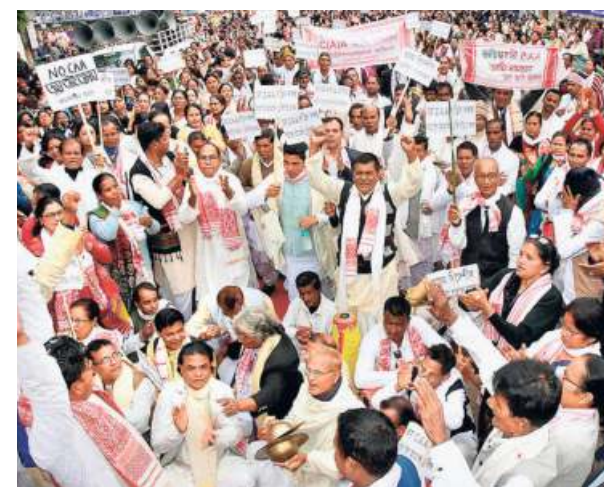
Protesters holding placards and raising slogans against the Citizenship (Amendment) Act in Sonitpur on Sunday.

Hundreds of people, including All Assam Students' Union leaders, celebrities, writers, artistes and general