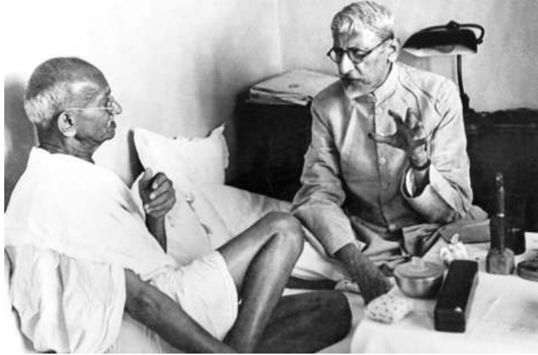
"Even though it may appear impossible to imagine a world where Kabir and Rumi, Gandhi and Maulana Azad, and Tagore and Nizamuddin Auliya work with us, it is a task we ought to strive for." Gandhi and Azad in Bombay.

The kind of Hindutva we see today is against some of the finest aspects of my religiosity that I learned as a Hindu. While the discourse of Hindutva with its hypermasculine nationalism is essentially monolithic