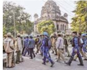
Police and RAF personnel on a patrol in Lucknow.

This comes after Chief Minister Yogi Adityanath's statement that the government would "take revenge"