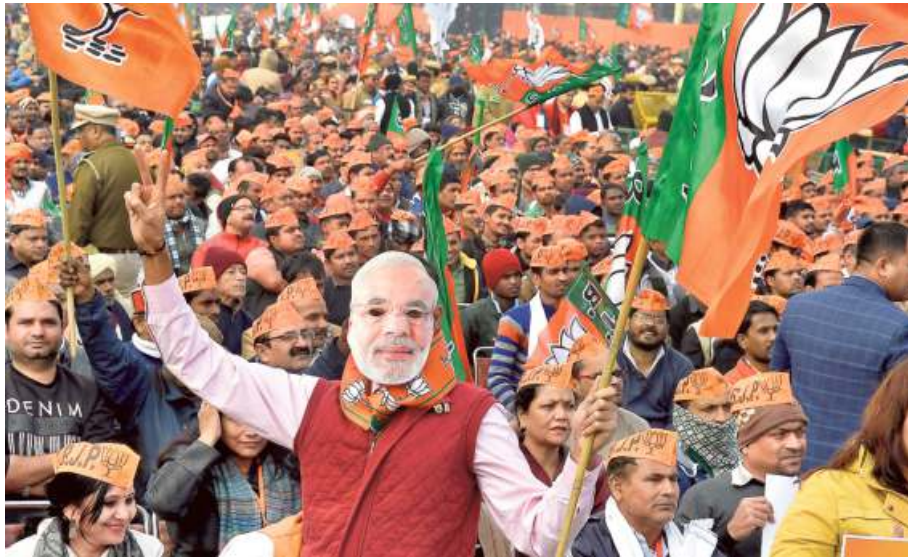
A man wears a mask of Prime Minister Narendra Modi during a BJP rally at Ramlila Maidan in New Delhi on Sunday.

"This venue has borne witness to many significant developments in its history... here I am happy that I and the BJP are able to get an opportunity to better the lives of over 40 lakh people in Delhi. Words such as 'unauthorised, bulldozer, slums', which are often associated with these colonies, need to end," Mr. Modi said, terming the residents of 1,731 unauthorised colonies "VIPs".