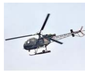
Minutes before PM's arrival at the ground, a helicopter making rounds over the venue.

"We have strict instructions from our superiors to be vigilant and thoroughly check every visitor entering the ground. Policemen in plainclothes were deployed among the crowd to keep watch on miscreants," said a police officer. Minutes before