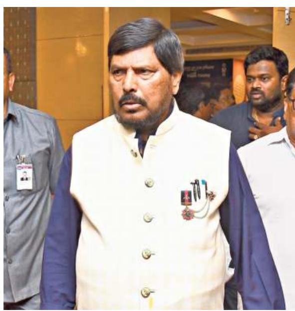
Taking pot shots at the CM, Ramdas Athawale asked when the Cabinet expansion and portfolio allocation of the new government would take place.

Mr. Athawale, whose party is an ally of the Bharatiya Janata Party (BJP) at the Centre and in the State, was speaking to reporters at VVIP Circuit House following a meeting of his party's executive committee and