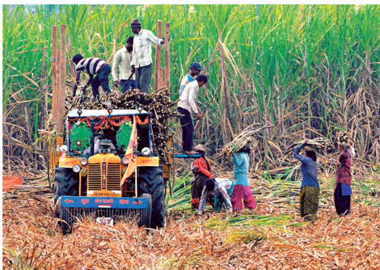
Ready for crushing: Farm labourers busy in harvesting sugarcane at Karad in Maharashtra on Saturday. ■ RAJU SANADI