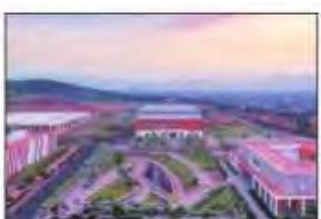
Research by Inspire Institute of Sport tracked menstrual cycles of athletes

A first-of-its-kind research in the country has shown that an alarming number of Indian athletes miss their periods and are deficient in key minerals, putting them at major risk of suffering career-threatening injuries as