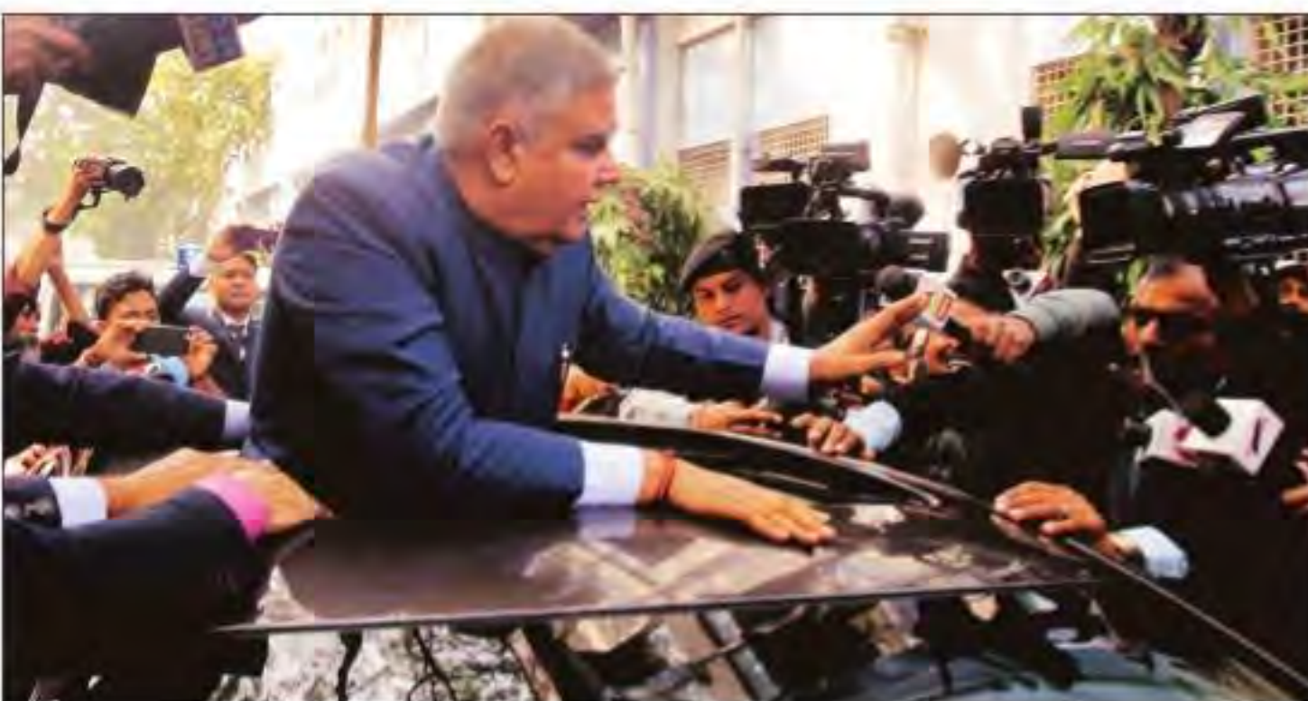
West Bengal Governor Jagdeep Dhankhar at Jadavpur University on Tuesday.