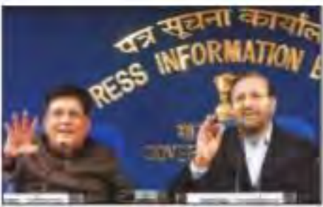
Ministers Prakash Javadekar, Piyush Goyal on Tuesday.

While the Census will cover the entire nation, the NPR exercise will be conducted in all states except Assam where the NRC exercise was conducted recently — and the final list