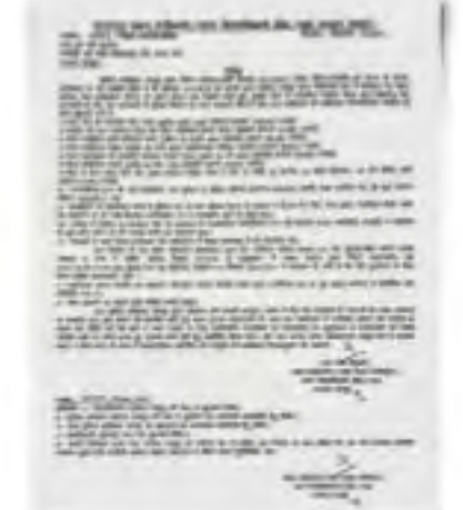
Notice lists cost of police barricades, sticks, vehicles

In identical notices issued Tuesday to 28 people, including an embroidery worker and a hawk of spices who are already in custody, the administration, while holding them responsible for acts of violence and damage to government property, has