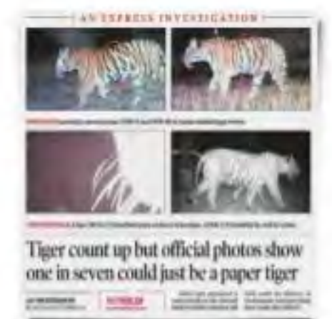
The Indian Express report on September 20, 2019

On July 29, the government had announced an estimated 2,987 tigers based on 2,462 individual tigers photographed across India.