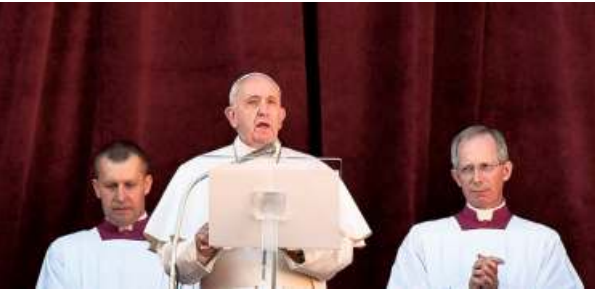
Powerful message: Pope Francis delivering the 'Urbi et Orbi' (To the City and the World) speech in Vatican on Wednesday.

Pope Francis appealed for peace in many of the world's hotspots, singling out the crises in the Middle East, Venezuela and Lebanon as well as armed conflicts ravaging many African countries. "May Christ bring his light to the many children suffering from war and conflicts in the Middle East and in various countries of the world," the 83-year-old pontiff said in his traditional Christmas message at the Vatican. "May he bring comfort to