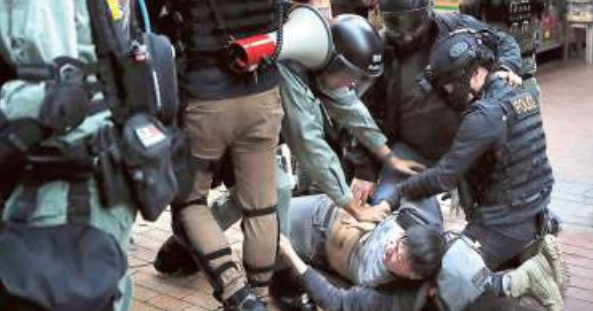
Pinned down: Riot police detaining a protester during a demonstration in Hong Kong on Wednesday.