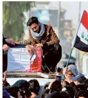
Mourners carrying the coffin of a civil activist during the funeral on Wednesday.

Iraqi anti-government protesters again hit the streets on Wednesday, angered by an activist's death and an attempt on the life of a popular TV satirist. The latest rallies in Baghdad and cities, including Basra and Karbala, came after a night of unrest that saw protesters torch the headquarters of two pro-Iran militias in the country's south. The demonstrators have rallied for almost three months to demand the ouster of the entire political class that has run the oil-rich yet poverty-ridden country