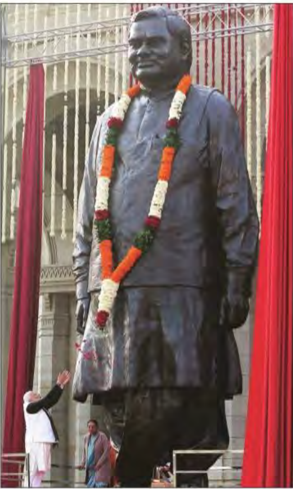
Prime Minister Narendra Modi unveils former Prime Minister Atal Bihari Vajpayee’s 25-ft statue in Lucknow on Wednesday. Vishal Srivastav