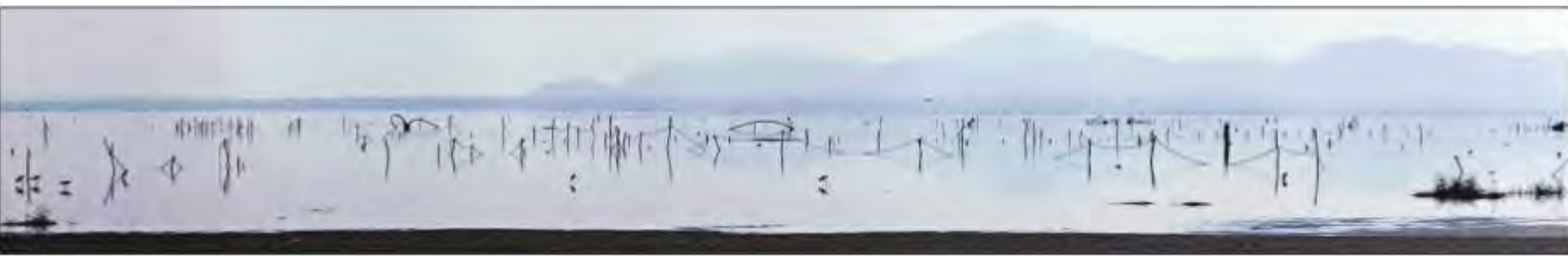
Due to record rain, a vast network of live wires running thousands of bore wells remained under lake water well into the migration season. Jay Mazoomdaar

When the birds arrived in October at Sambhar, India’s largest saltwater lake, they were greeted, thanks to heavy rain, by water levels at the two-decade high. Under the surface was a messy network of cables that came alive every night to power thousands of illegal bore wells that keep Sambhar’s innumerable