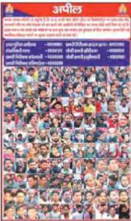
Police have put out posters in Kanpur, Firozabad, Mau

At least 16 people have been killed in protests across the state. According to an official at the DGP Headquarters, police have so far registered 213 cases and arrested 925 people.