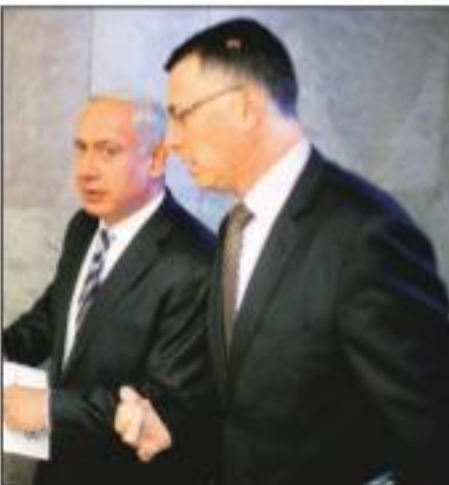
Benjamin Netanyahu with his challenger for Likud party leadership, Gideon Saar.

"We are imbued with the spirit of victory," lawmaker Yoav Kisch, Saar's campaign manager, told Israeli Army Radio. "This candidacy is good for the party and I believe can also bring the