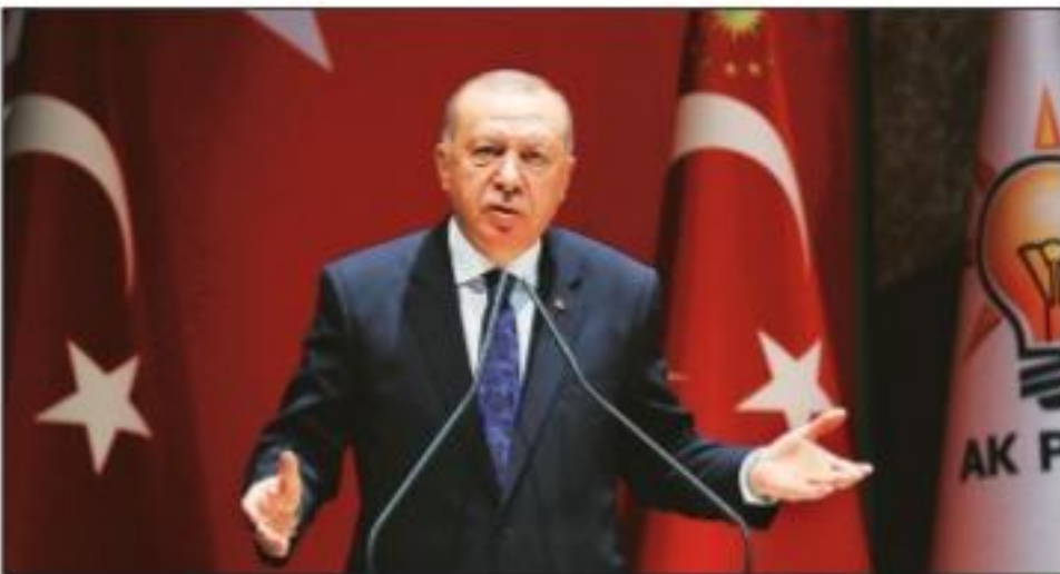
Turkish President Recep Tayyip Erdogan at a meeting of his ruling AK Party in Ankara on Thursday.

Last month, Ankara signed two separate accords with the GNA, led by Fayeze al-Serraj, one on security