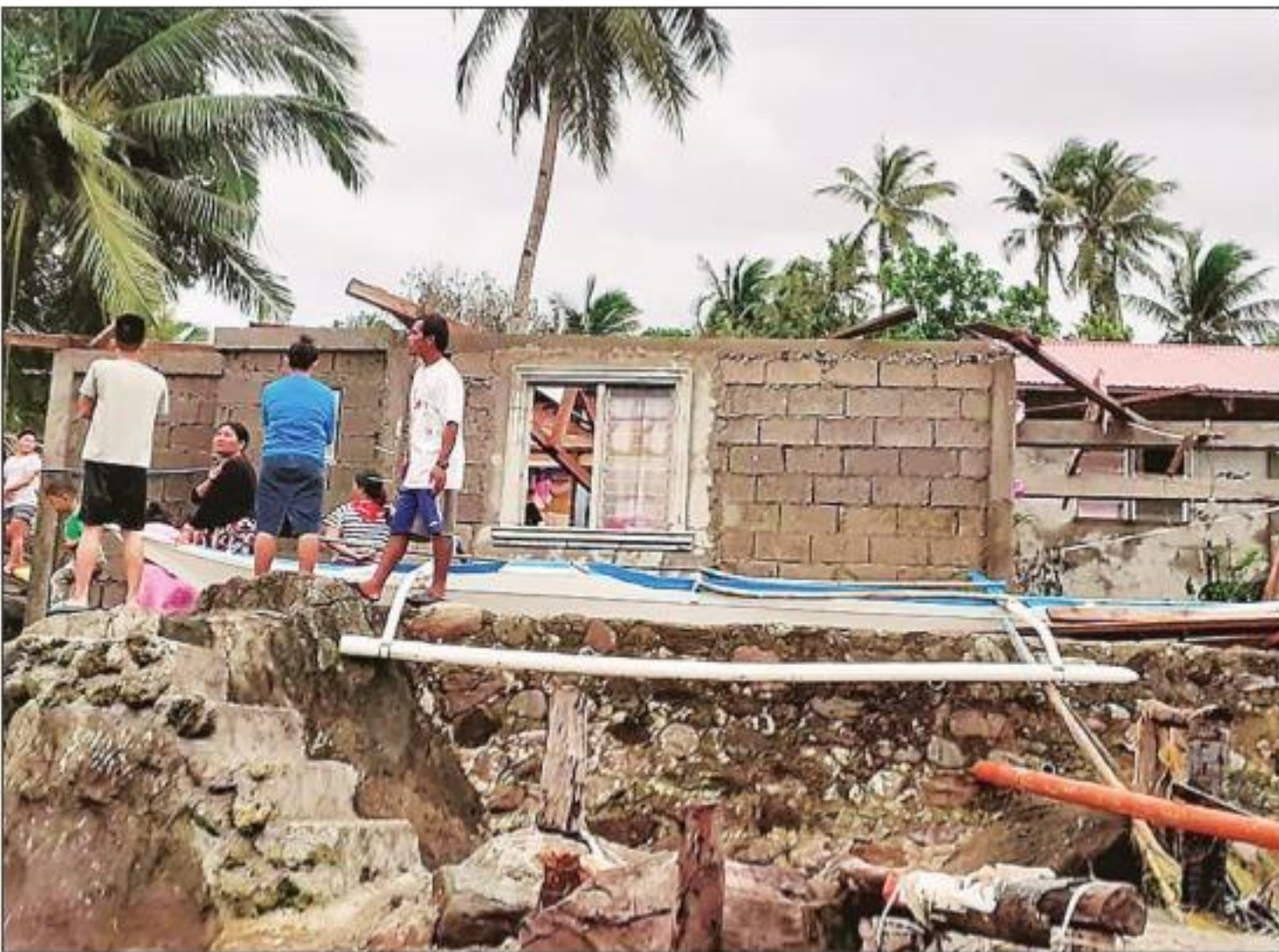
In Biliran, Philippines, on Thursday after the typhoon wreaked havoc.

■ A typhoon that barreled through Philippines left at least 20 people dead and forced thousands to flee, devastating Christmas celebrations in the country, which is predominantly Catholic.