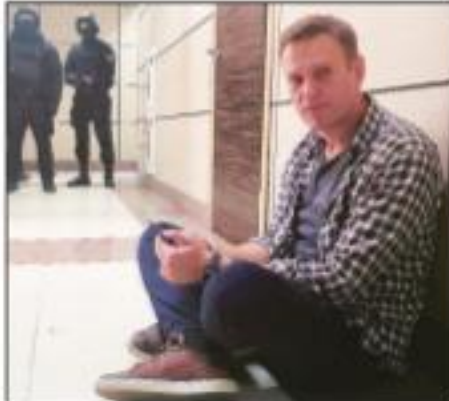
Alexei Navalny outside the office of his Anti-Corruption Foundation during the police raid.

RUSSIAN AUTHORITIES raided the Moscow headquarters of opposition politician Alexei Navalny on Thursday, using power tools to gain entry before dragging Navalny out by force and confiscating technical equipment such as laptops. Navalny and his allies said the raid on his Anti-Corruption Foundation (FBK) was carried out by the Federal Bailiffs Service and was connected to his refusal to delete a video investigation which levelled graft allegations against Prime Minister Dmitry Medvedev and billionaire businessman Alisher Usmanov. The Federal Bailiffs Service said it was carrying out investigative activities at Navalny's foundation as part of a criminal investigation. Usmanov brought and won a defamation lawsuit against Navalny in 2017. That case ended with a court ordering Navalny to delete within 10 days all references to the allegations in his video, which Medvedev and Usmanov said were utterly false. Navalny said on Thursday he would not delete the video, which has been watched over 32 million times on YouTube since it was first posted in March 2017. REUTERS