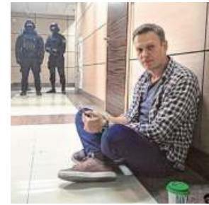
Alexei Navalny sitting outside his office during the raid on Thursday.

Russian authorities raided the Moscow headquarters of Opposition politician Alexei Navalny on Thursday, using power tools to gain entry before dragging Mr. Navalny out by force and confiscating technical equipment such as laptops. Mr. Navalny and his allies said the raid on his Anti-Corruption Foundation (FBK) was carried out by the Federal Bailiffs Service and was connected to his refusal to delete a video investigation which levelled graft allegations against Prime Minister Dmitry Medvedev and billionaire businessman Alisher Usmanov. The Federal Bailiffs Service said it was carrying out investigative activities at Mr. Navalny's foundation as part of a criminal investigation. It said it had not detained