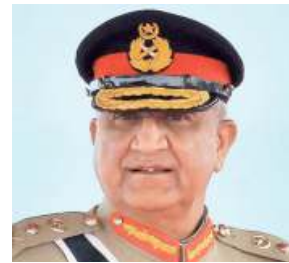
General Qamar Javed Bajwa

The Pakistan government on Thursday filed a review petition against the Supreme Court's decision about legislation on the extension of service of Army chief General Qamar Javed Bajwa. A three-member Bench headed by then Chief Justice Asif Saeed Khosa on November 28 granted a six-month extension to Gen. Bajwa after being assured by the government that Parliament will pass a legislation on the extension/reappointment of an army chief within six months. The ruling came in the