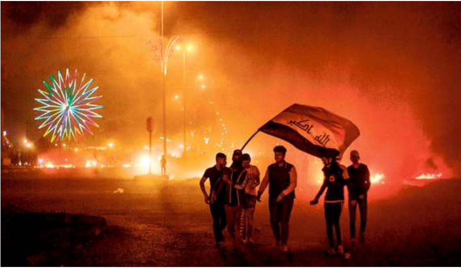
Sticking to their demands: Anti-government activists walking with a national flag at a makeshift roadblock in the southern city of Basra late on Wednesday.

In a letter to Parliament, Mr. Saleh said he wished to guarantee the "independence, sovereignty, unity and territorial integrity" of Iraq. But he cited the Constitution, which obliges the President to task the candidate put forward by Parliament's biggest bloc with forming a government.