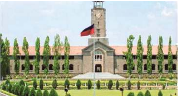
Major mishap: A Court of Inquiry has been ordered by the authorities into the incident.

“During the training of bridge construction, the tower support collapsed