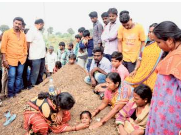
Unsound customs: Disabled children being buried in compost mud at a village in Karnataka on Thursday.