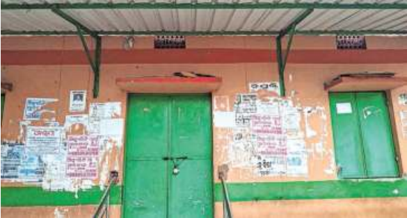
No service: A closed Aahar Kendra at the Old Bus Stand area in Odisha's Berhampur.

The authorities ordered closure of the centres fearing that there might be wastage of food.