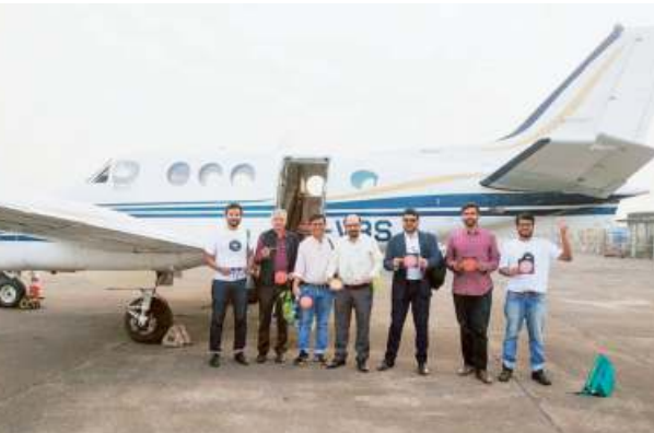
Astro tourism: The six-seater Beechcraft C-90 aircraft that took to the skies to view the solar eclipse.

was jointly organised by Space Geeks – a group that promotes space and astronomy – and private jet operator MAB Aviation.