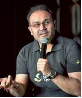
Virender Sehwag.

Established to honour the former India captain, who passed away in 2011, the in-