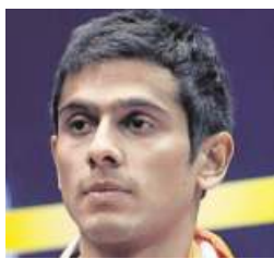
SAURAV GHOSAL (SQUASH)

Prajnesh rose to a career-high world rank of 75 in 2019. He is the sixth-best ranked Indian tennis player in the Open era, behind Vijay Amritraj (18), Ramesh Krishnan (23), Somdev Devvarman (62), Leander Paes (73) and Anand Amritraj (74). He played all four Grand Slams this year. While he qualified for the Australian Open, Prajnesh had direct entry at the French Open, Wimbledon and the US Open. Prajnesh also qualified and beat 69th ranked Benoit Paire and 18th ranked Nikoloz Basilashvili at the ATP Masters event in Indian Wells.