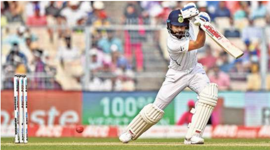
Imperious: Virat Kohli has scored 5,775 more international runs than anyone else in the last 10 years.

He is third in the list of leading run-scorers of all time with 21,444 runs, behind Ponting (27,483) and Tendulkar (34,357).