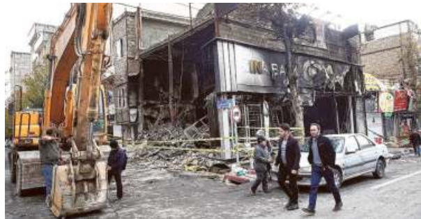
A grim picture: A file photo of people walking near a burnt bank, after protests against increased fuel prices in Tehran

Many take their grievances against the govt. to cemeteries where the killed protesters are buried