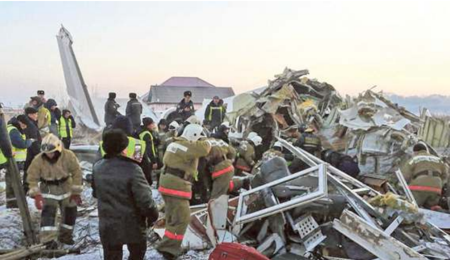
Gone in seconds: Police and rescuers working on the site of the plane crash near Almaty International Airport in Kazakhstan on Friday.

REUTERS ALMATY Twelve people were killed and dozens injured when a plane with nearly 100 passengers and crew on board crashed soon after take-off in Kazakhstan on Friday. The Bek Air Fokker 100 got into trouble shortly after departing from Almaty, the Central Asian country's commercial centre, on a pre-dawn flight to the capital Nur-Sultan. It lost altitude during take-off and broke through a concrete fence before hitting a two-storey building, Kazakhstan's Civil Aviation Committee said. It was not immediately clear what caused the crash. "The plane tilted to the left, then to the right, then it started shaking while still trying to gain altitude," said businessman Aslan Nazaraliyev, who survived the crash. Investigators found scratch marks on the runway. "Before crashing, the aircraft touched the runway with its tail twice, the gear was retracted," Deputy Prime Minister Roman