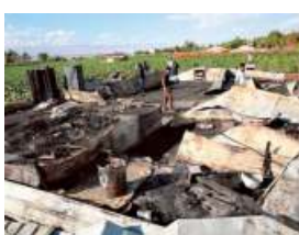
The remains of the home razed in fire in South Shuna, Jordan.

Thirteen Pakistanis, including eight children, died on early Monday when a blaze tore through their corrugated metal home in a rural area of western Jordan, authorities said. Rescue services said “13 people died and three others were injured when fire broke out in a corrugated metal house” on a farm in South Shuna, around 50 km west of Amman.