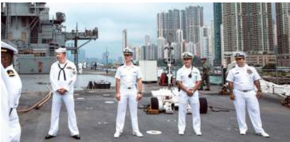
Countermeasures: A file photo of crew members on the deck of the USS Blue Ridge during a port call in Hong Kong. •AFF

China suspended U.S. warship visits and sanctioned American NGOs on Monday in retaliation for the passage of a Bill backing pro-democracy protesters in Hong Kong. The financial hub has been rocked by nearly six months of increasingly violent unrest demanding greater autonomy, which Beijing has frequently blamed on foreign influence. Last week U.S. President Donald Trump signed the Hong Kong Human Rights and Democracy Act, which requires the President to annually review the city's favourable trade status and threatens to revoke it if the semi-autonomous territory's freedoms are quashed.