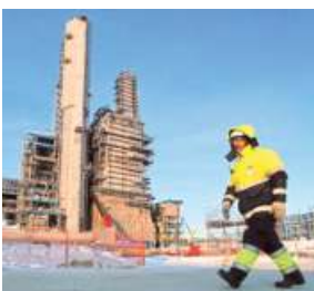
A worker at a gas processing plant under construction in Amur, Russia.

border with China, Alexi Miller, the head of the Russian gas giant Gazprom, which has played a leading role in conceiving and implementing the project, invited Mr. Putin and President Xi to the inaugural via a video link. “Dear Vladimir Vladimirovich, allow me to give a command to open the pipeline valve,” Mr. Miller said, addressing President Putin, the Russian news agency Tass reported. On receiving Mr. Putin's