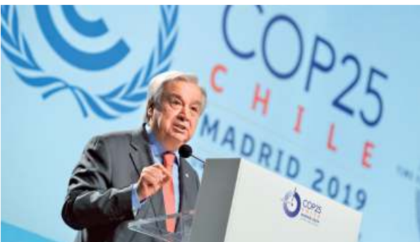
Antonio Guterres at the COP25 in Madrid.

REUTERS MADRID The world must choose hope over surrender in the fight against climate change, UN secretary-general Antonio Guterres said on Monday, warning a summit in Madrid that governments risked sleepwalking past a point of no return. Two weeks of talks aimed at bolstering the 2015 Paris Agreement to curb global warming began against a backdrop of unusually severe weather disasters this year, from fires in the Arctic, Amazon and Australia to intense tropical hurricanes. Mr. Guterres, a former Portuguese Prime Minister and leading advocate of more ambitious action to reverse the upward march of