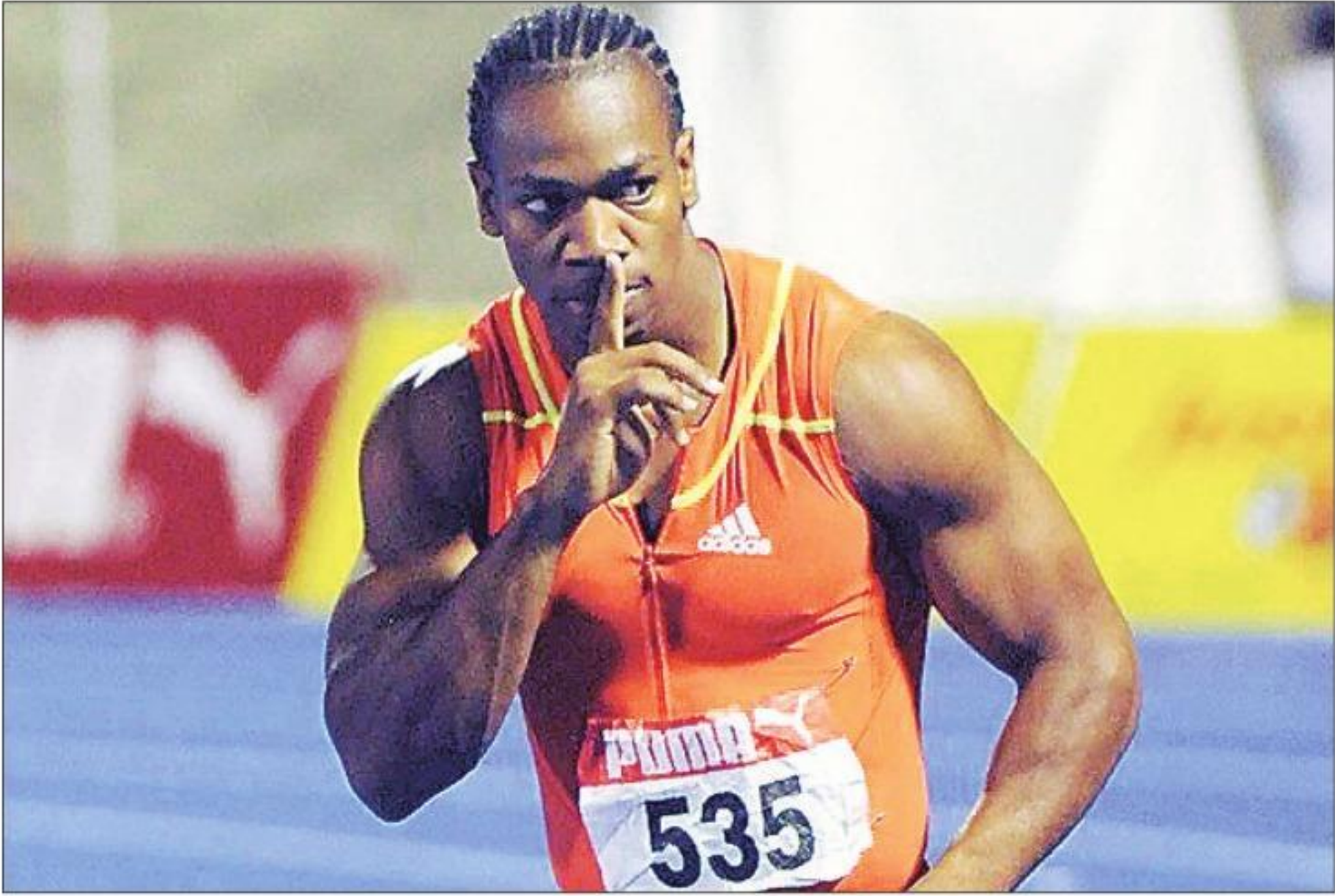
Yohan Blake is the second-fastest sprinter in history – behind Usain Bolt’s mark of 9.58 seconds in 100m.

Everyone has to look up to me. This is going to be my last Olympics, so I’m definitely going for the gold. I have got many medals in the past, but this will put the icing on the cake for me at the Tokyo Olympics.”