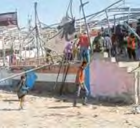
People gathering at the scene of a blast in al-Dhalea, Yemen.

REUTERS DUBAI A missile fired by the Iran-aligned Houthi group struck a military parade in Yemen's town of al-Dhalea, killing at least six people and injuring others, government-allied southern separatist forces who control the area said on Sunday. No claim of responsibility was made and Houthi media