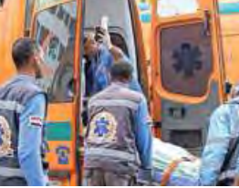
Paramedics transporting a victim upon arrival at Suez General Hospital.

PRESS TRUST OF INDIA CAIRO Three Indians were killed and 13 others injured when two buses carrying tourists crashed into a truck in Egypt's Suez governorate, the Indian Embassy here said on Sunday. The buses were heading to the beach-resort town of Hurghada on Saturday when they collided with the truck near Ain Sokhna town, about 120 km east of Cairo. "We regret to inform that