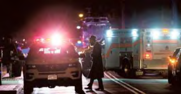
Difficult times: A Jewish man walking near the area where five people were stabbed in Monsey on Saturday.

Victims were rushed to nearby hospitals, with no official details on their injuries. The police said a suspect was later arrested. "This is an act of terrorism. I think these are domestic terrorists. They are trying to inflict fear," New York Governor Andrew Cuomo told reporters at the scene on Sunday. "They're motivated by hate. They are doing mass attacks. These are ter-