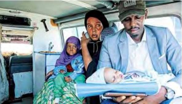
Seeking aid: A couple carrying their wounded child to be airlifted to Turkey for treatment on Sunday.