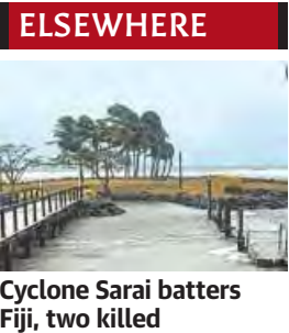
Cyclone Sarai batters Fiji, two killed WELLINGTON Tropical Cyclone Sarai was moving slowly away from Fiji on Sunday, leaving two people dead and more than 2,500 needing emergency shelter. The cyclone damaged houses, crops and trees, cut power and forced the cancellation of several flights, stranding holidaymakers visiting the island nation, which is a major tourist draw. AFP

50 dead as cold wave grips Bangladesh DHAKA At least 50 people have died in Bangladesh as cold weather continues to sweep across the country, officials said. The country's lowest temperature this year was recorded at 4.5° C early on Sunday in Tetulia, a border town in Bangladesh's north, the weather office said. The weather office said the cold snap, accompanied by chilly winds and dense fog, was likely to continue for few more days. REUTERS