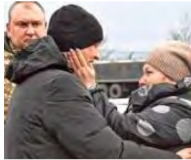
An Ukrainian prisoner being embraced by his mother after his release.

AGENCE FRANCE-PRESSE CHECKPOINT MAYORSKE Ukraine and Russia-backed separatists in the country's war-torn east exchanged 200 prisoners on Sunday, swapping detained fighters for civilians and servicemen held captive in some cases for years in two breakaway regions. Kiev handed over to separatists five riot policemen suspected of killing protesters during a pro-Western uprising in 2014 as part of the swap, sparking public outrage. "The mutual release of the detainees has