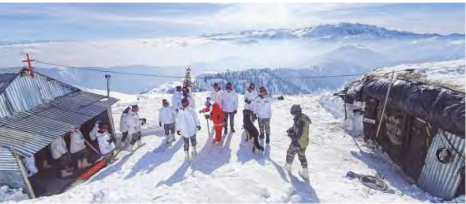
Best friends: Army personnel with their dog 'Buzo' returning to the base camp in North Kashmir along the LoC, on December 23, 2019. ■ PTI

The canines posted along the LoC in the heights of North Kashmir are generally 'double-coat German Shepherds' which are best suit-