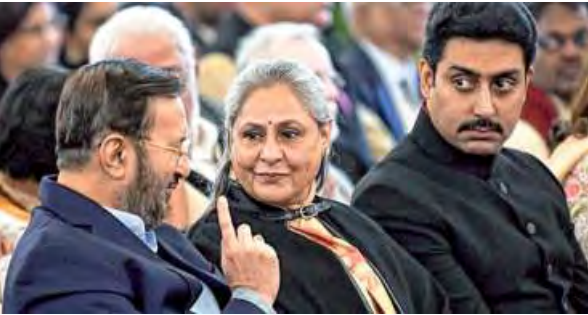
In conversation: Union Minister Prakash Javadekar, left, with Jaya and Abhishek Bachchan.

"When this award was announced, a doubt arose in my mind: if this is an indication for me to sit at home and relax after working for so many years? There is some more work I have to finish and certain possibilities are coming up where I may get a chance to do some work. I just wanted some