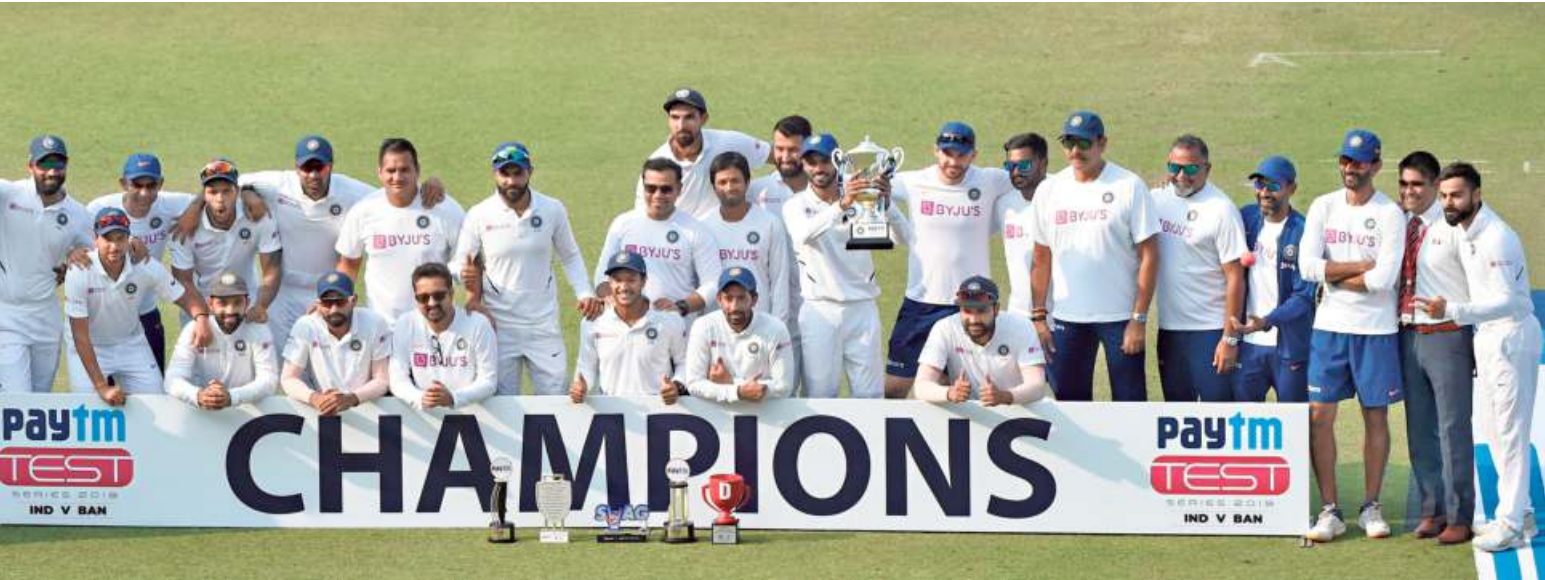
The dazzlers: Team India has made 'Playing to win every Test' its magic mantra.

Brains trust’s focus on the importance of workload management pays dividends