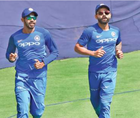
Just recognition: Jasprit Bumrah and Virat Kohli's heroics for India have fetched them a place on the elite list.

PRESS TRUST OF INDIA LONDON India skipper Virat Kohli and pace spearhead Jasprit Bumrah were the only two Indians who found a place in Wisden's T20 International team of the decade, which didn't feature M.S. Dhoni. Australia's limited-overs captain Aaron Finch was named captain of the team, which has two more Australian in Shane Watson and Glenn Maxwell, two England cricketers – Jos Buttler and David Willey, two Afghanistan all-rounders – Mohammad Nabi and Rashid Khan, and New Zealand's Colin Munro and Sri Lanka's Lasith Malinga. On Kohli, Wisden said: “While Kohli's record in domestic T20 cricket is patchy, the same cannot be said of T20Is. Kohli's average of 53 was the best in the decade, and while his consistency compromises his strike-rate slightly, he is still able to score at a good rate, even if not exceptional. Kohli, who ranks third in the list of leading run-scorers of all time with 21,444