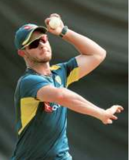
D'Arcy Short.

AGENCE FRANCE-PRESSE MELBOURNE D'Arcy Short was on Monday added to the Australian squad for its upcoming one-day tour of India, with all-rounder Sean Abbott sidelined for up to a month with a side strain. The three-match tour gets under way on January 14 in Mumbai and National selector Trevor Hohns said all-rounder Short deserved his chance. Abbott picked up the injury playing for Sydney Sixers in the Big Bash League on Friday. The squad: Aaron Finch (Capt.), Ashton Agar, Alex Carey, Pat Cummins, Peter Handscomb, Josh Hazlewood, Marnus Labuschagne, Kane Richardson, D'Arcy Short, Steve Smith, Mitchell Starc, Ashton Turner, David Warner and Adam Zampa.