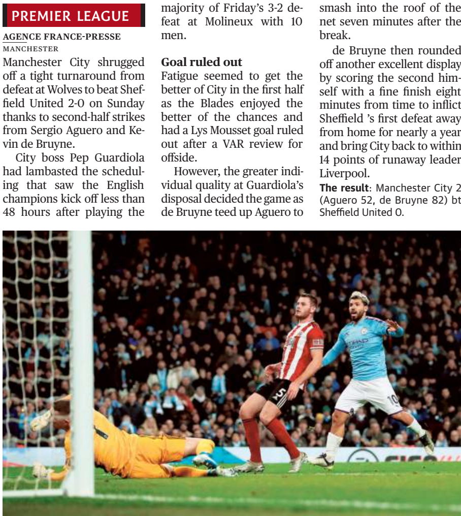
On target: Sergio Agüero scores Manchester City's first goal against Sheffield United.

Defending champion back to within 14 points of Liverpool