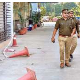
Policemen at the crime spot.

"The two children were possibly killed before the el-