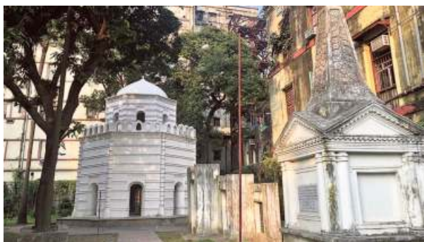
The Moroccan-style mausoleum of Job Charnock in the compound of St. John's Church in Kolkata.

"Leftover food, empty liquor bottles – everything is flung into the compound. Recently, a packet containing leftover food almost hit the head of a Westerner who had come to see Charnock's grave. He was nice enough to