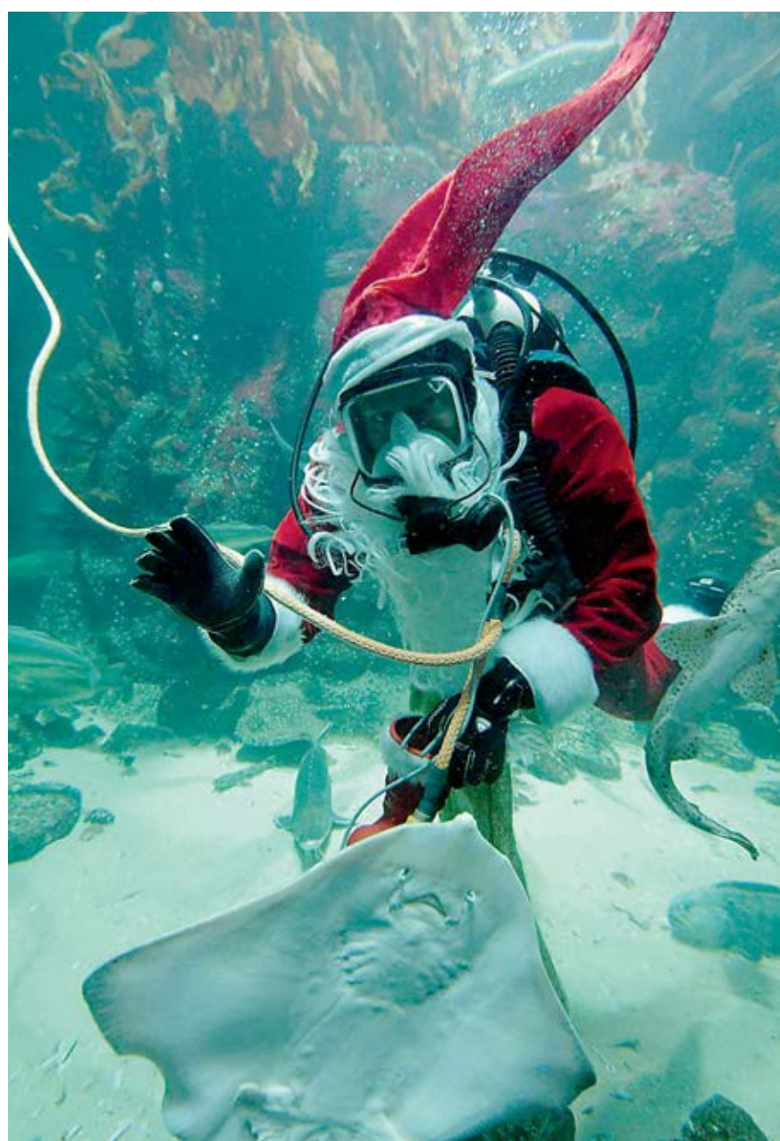
A diver dressed as Santa Claus feeds a ray at the aquarium of the Multimur Wattforum national park centre in Toenneing, northern Germany, during a rehearsal for a visitor event on St. Nicholas Day.