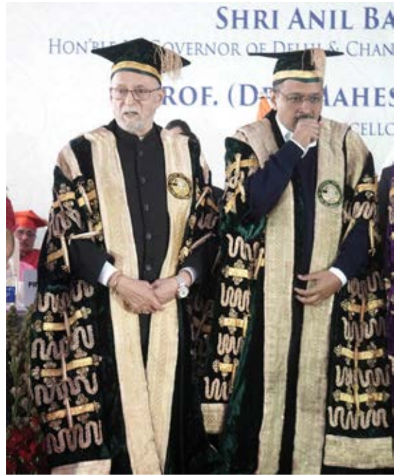
L-G Anil Bajjal and CM Arvind Kejriwal at the convocation of Guru Gobind Singh Indraprastha University in New Delhi on Tuesday.

The front runners for the post are BJP state unit head Manoj Tiwari, former local unit president Vijay Goel, Leader of Opposition in Delhi Assembly Vijender Gupta, and Union health minister Dr Harsh Vardhan.