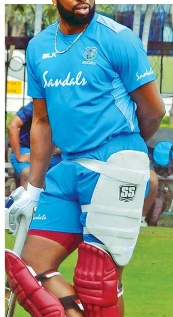
Kieron Pollard during a training session in Hyderabad on Tuesday.

New Zealand resumed the day at 96 for two with England hunting early