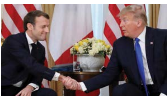
US President Donald Trump and France's President Emmanuel Macron shake hands during their meeting in London on Tuesday.

London, Dec. 3: US President Donald Trump launched a blistering attack on France's criticism of Nato strategy as "brain dead" on Tuesday, but French leader Emmanuel Macron doubled down and turned his fire on Turkey. The three-way battle overshadowed the build-up to the alliance's 70th anniversary summit in London, threatening to derail efforts to show unity in the face of Russia and China. Mr Macron had tried to shake up the agenda of the meeting by demanding a review of Nato strategy, but Trump — who arrived boasting that he had forced members to boost defence spending — hit back hard. "I think that's very insulting," Mr Trump said of Mr Macron's assertion in November that Nato's is experiencing "brain death" and should focus more on