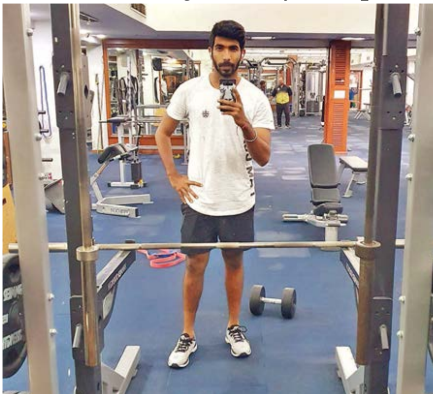
Jasprit Bumrah during a gym session.