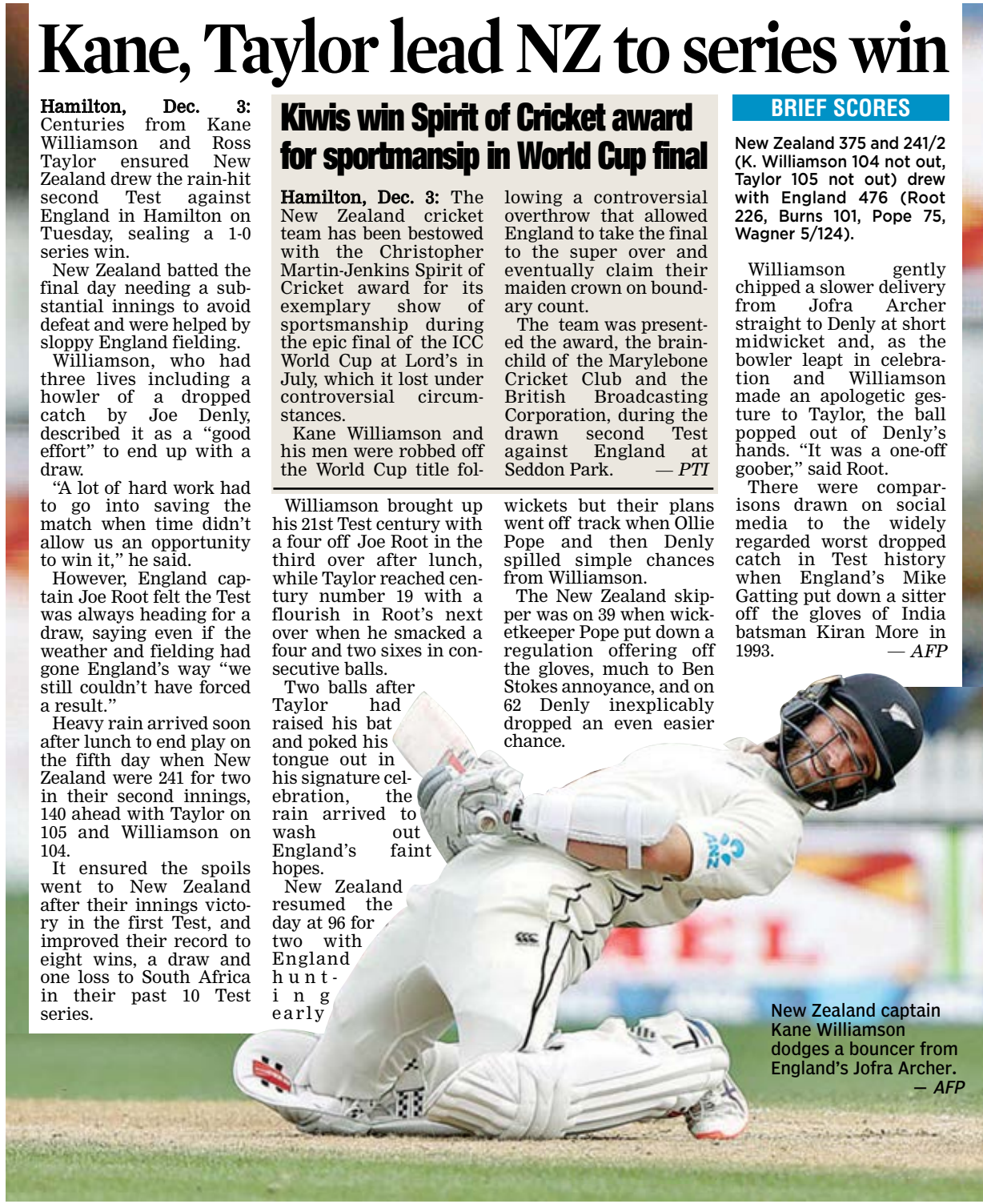
New Zealand captain Kane Williamson dodges a bouncer from England's Jofra Archer.