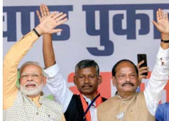
Prime Minister Narendra Modi with Jharkhand chief minister Raghubar Das waves at supporters during an election rally in Jamshedpur on Tuesday.

The economic slowdown could possibly emerge as the major threat for the ruling BJP in Jharkhand. Generally seen as one of the nation's "poorest states", the figures indicate that lack of industries and development have also contributed heavily to the rising unemployment in the state. While unemployment continues to plague the state and the UNDP data indicate that nearly "46 per cent of the state is living in poverty", one of the key issues being raised by the BJP is the National Register of Citizens. While the experiment of playing