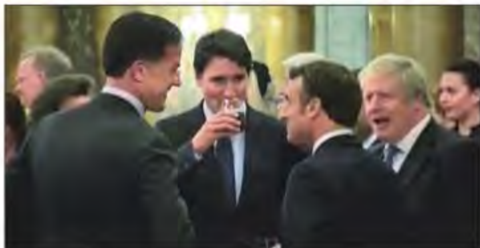
A brief video showed world leaders at a Buckingham Palace reception apparently talking about Trump.

The brief video showed grinning world leaders at a Buckingham Palace reception Tuesday night, apparently com-