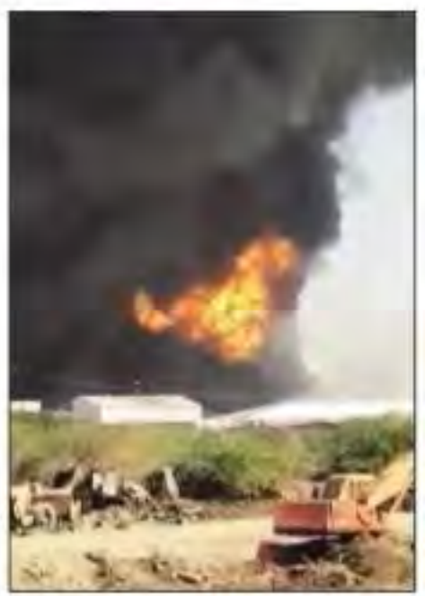
The blast took place at Seela Ceramic Factory in Bahri area of Khartoum.

Prime Minister Narendra Modi expressed grief over the incident. "Anguished by the blast in a ceramic factory in Sudan, where some Indian workers have lost their lives and some are injured.