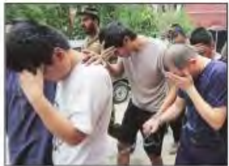
Men arrested in the trafficking scheme being taken to a court in Lahore in May.

The list gives the most concrete figure yet for the number of women caught up in the trafficking schemes since 2018.