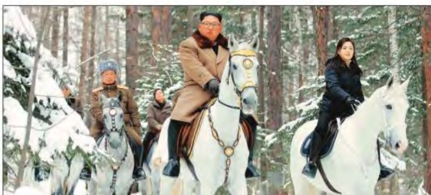
Kim Jong Un rides a horse as he visits battle sites in areas of Mt Paektu.

The United States has called for North Korea to give up significant portions of its nuclear arsenal before punishing international sanctions are eased, while Pyongyang has accused the United States of "gangster-like" demands for uni-