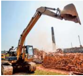
Bangladesh is closing down illegal brick factories to cut high smog levels.

And in Germany, the period from April-July 2018 was the hottest ever recorded in the country, leading to the deaths of over 1,200 people.