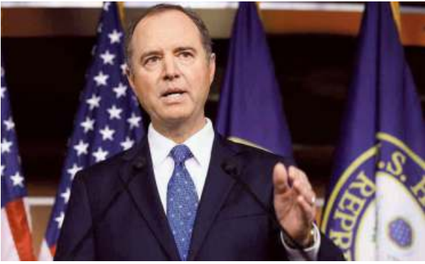
Mounting pressure: House Intelligence Committee Chairman Adam Schiff speaking to reporters in Washington.

The report concludes that Mr. Trump scheduled a White House meeting with Ukrainian President Volodymyr Zelensky and offered a military aid of $391 million to Ukraine conditional on Uk-