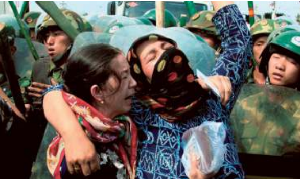
Tough stand: Women confronting Chinese paramilitary police during a protest in Urumqi in Xinjiang, China.

The Uighur Bill, which passed by 407-1 in the Democratic-controlled House, requires the U.S. President to condemn abuses against Muslims and call for the closure of mass detention camps in the northwestern region of Xinjiang. It calls for sanctions against senior Chinese officials who, it says, are responsible. It specifically