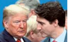
Delicate ties: Donald Trump with Justin Trudeau in Watford, Britain.

The 29 leaders meeting outside London to mark the 70 th anniversary of the Atlantic alliance agreed a joint statement despite divides over spending and strategy and sharp exchanges bet-