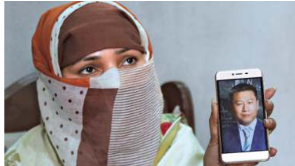
A survivor of illegal trafficking showing a picture of her Chinese husband, in this file photo.

But since the time it was put together in June, investigators’ aggressive drive against the networks has largely ground to a halt, largely