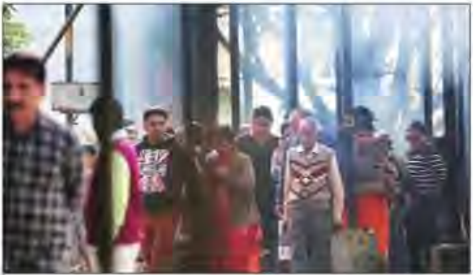
At the cremation ground in Ghaziabad on Wednesday.