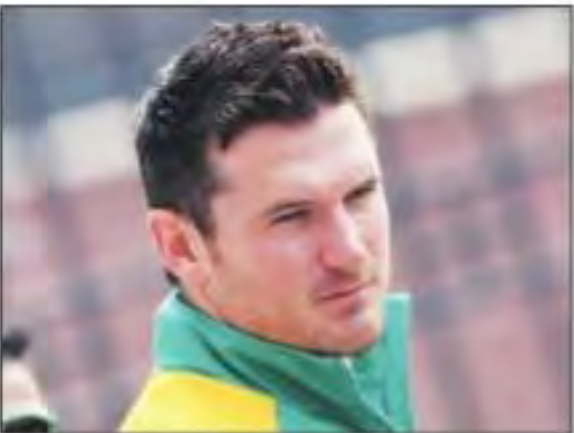
Ex-captain Graeme Smith is in talks for director of cricket role.

CONFUSION OVER DOMESTIC STRUCTURE: CSA plans to increase the number of domestic teams from six to 12. It is facing resistance because it is likely to result in a reduction in players' earnings, some even losing their jobs. CSA also tried to take over the leadership of one of the provincial unions.