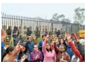
DU teachers protesting outside the V-C's office on Thursday.

to amend the controversial circular, which had directed colleges to appoint guest teachers against vacancies arising in the current academic session, to include the terms "ad hoc/temporary/