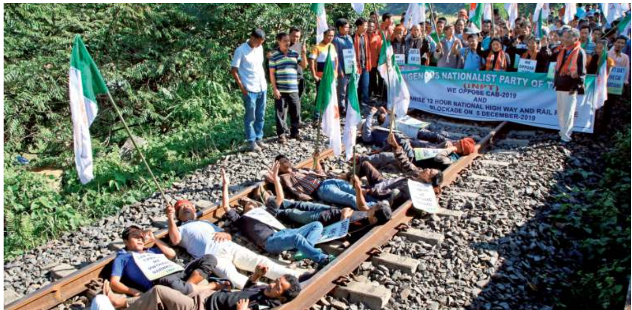
Line block: Activists of the Indigenous Nationalist Party of Twipra blocking railway tracks to protest against the Citizenship (Amendment) Bill at Khamtingbari on the outskirts of Agartala on Thursday. (NON-MUSLIMS STAND TO GAIN: PAGE 13)