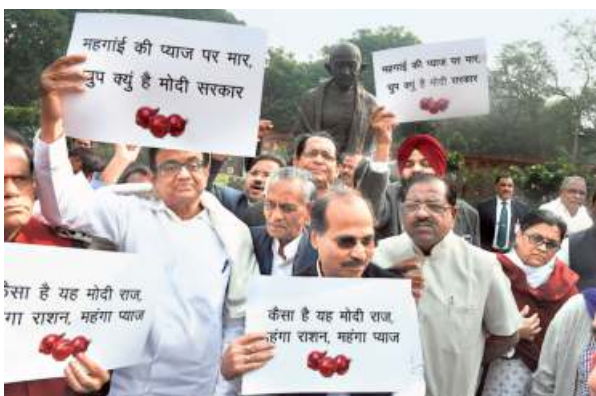
Raring to go: P. Chidambaram and other Congress MPs staging a protest over high onion prices in New Delhi.

Mr. Chidambaram, who spent 106 days in judicial remand in money laundering and corruption cases, also hinted at the hardships he faced during his incarceration, stating that his "spine and head had become stronger by sleeping on a wooden cot without a pillow".