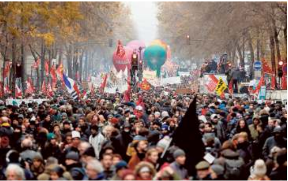
Traffic hit: A demonstration against the government’s pensions reform plan in Paris on Thursday.