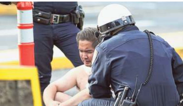
Security forces attending to a victim outside the Joint Base Pearl Harbor-Hickam in Honolulu.

Authorities did not identify the victims or the gunman, described by a witness as wearing a U.S. Navy uniform, but local media reported they were all men. Base officials said the victims were civilians working for the Department of Defense. It was not immediately