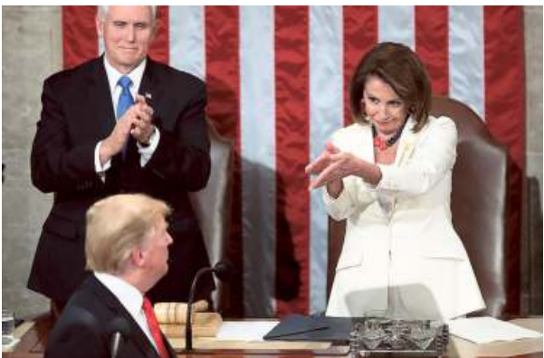
More trouble: President Trump turns to Speaker Nancy Pelosi during the State of the Union address in Washington.

Wrapping her announcement in the words of the Constitution and the nation’s founders, Ms. Pelosi said it had become clear over the course of two months of investigation that Mr. Trump had violated his oath of office by pressing a foreign power for help in the 2020 election. Allowing Mr. Trump to continue in office without remedy, she said, would come at “the peril of our republic.”