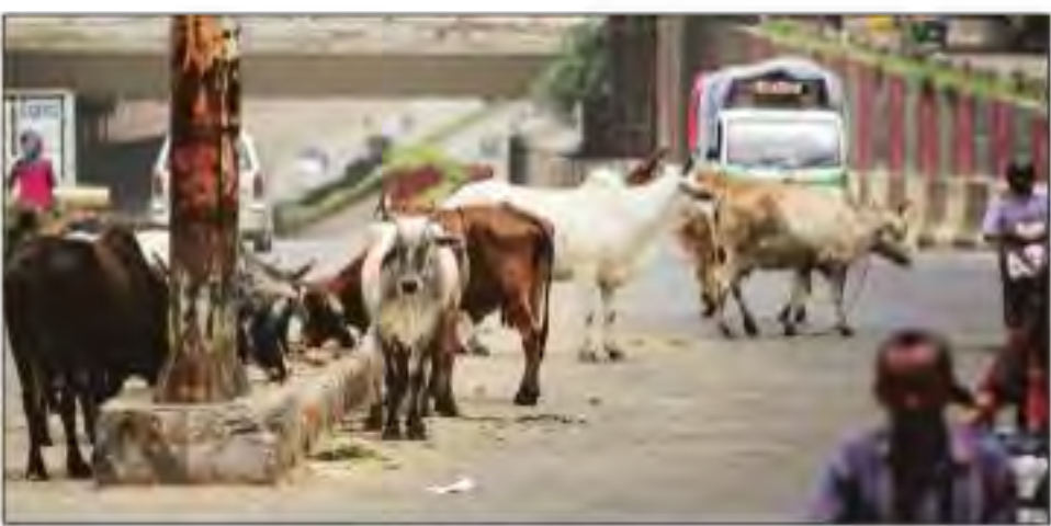
Will solve problem of stray cattle, boost tourism: UP Minister