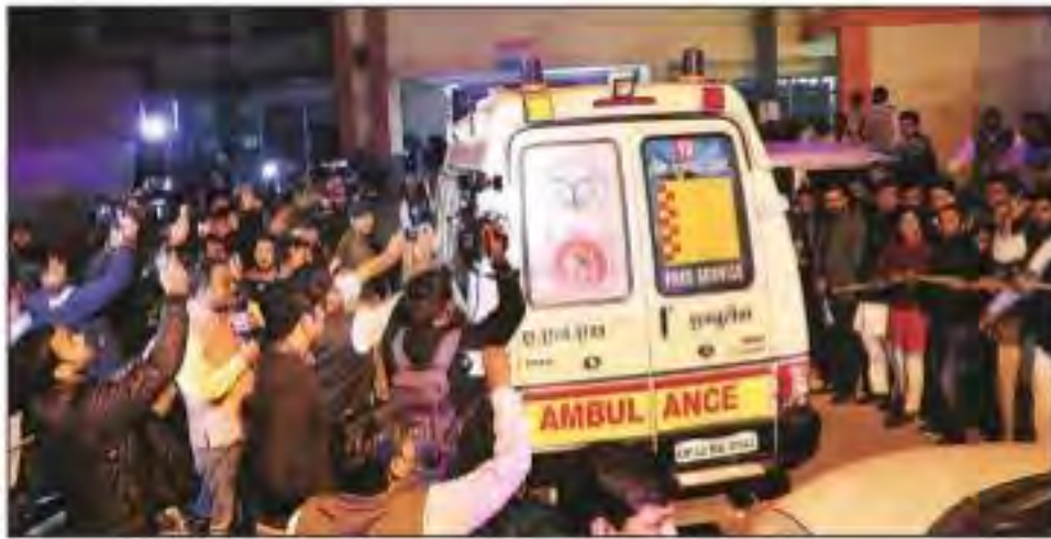
The victim was airlifted from Lucknow to Delhi.