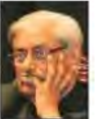
Justice Arun Mishra