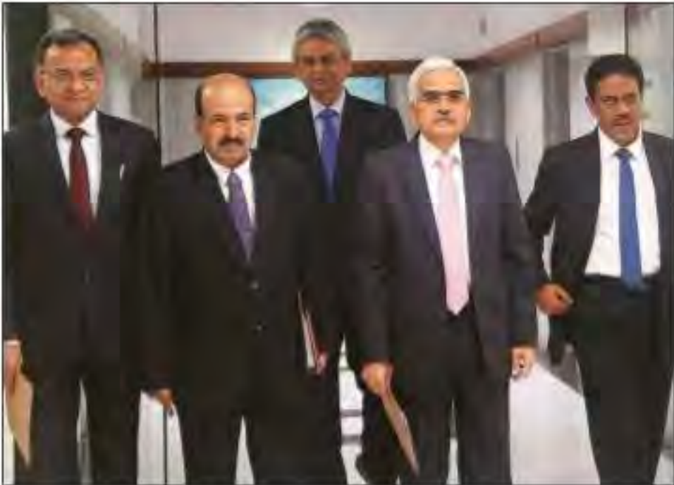
RBI Governor Shaktikanta Das with his deputies in Mumbai on Thursday.