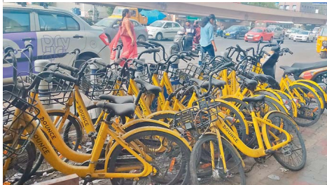
There are few takers for the bicycles offered at Metro Rail stations. The bicycles were meant to be hired by Metro commuters to reach their destinations.