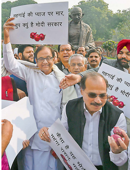
Congress leaders P. Chidambaram and Adhir Ranjan Chowdhury stage a protest against hike in onion prices at Parliament, in New Delhi on Thursday.