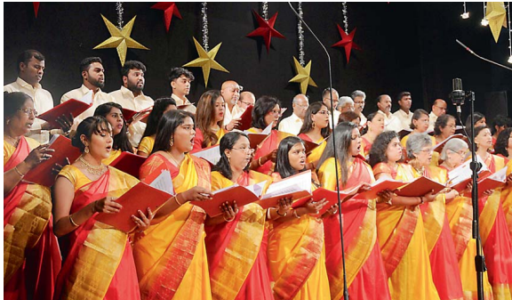
With the Christmas spirit in the air, carol singing was organised at Ravindra Bharti, Hyderabad, on Thursdays.