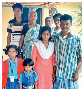
A Lankan Tamil family in RV Nagar, close to Lammasinghi, near Chintapalle in the Visakhapatnam agency.