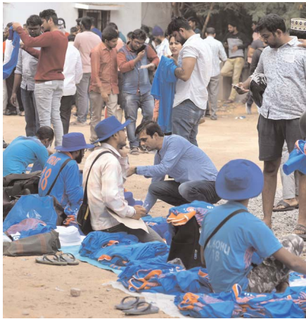
Cricket enthusiasts thronged the Gymkhana Grounds to buy tickets for Friday's cricket match while vendors cashed in on the cricket fever by selling India cricket team shirts and caps.