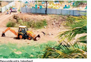
The Devununkunta lakebed