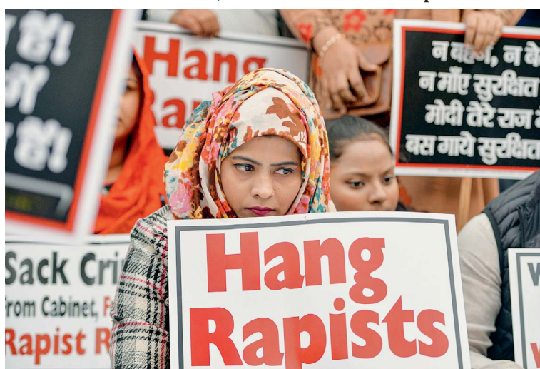
Activists hold placards as they participate in a silent protest demanding the Centre to create a strong system of deterrence punishment to rapists in the country in New Delhi on Friday.

The President's remarks came at a time the country witnessed several cases of brutal attacks on women. — PTI