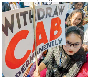
College students protest after the Citizenship (Amendment) Bill was cleared by the Union Cabinet recently in Guwahati on Friday.

During the period from July 2014 — October 2019, provisions of Fundamental Rules or FR 56(j) have