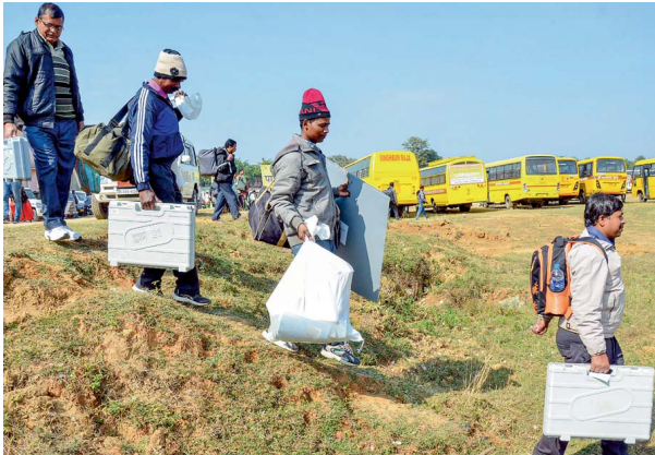
Polling officials carry EVM machines and other polling materials on the eve of the second phase of Jharkhand Assembly election, at Tamar constituency under Bundu sub-division near Ranchi on Friday.