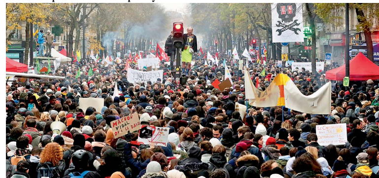
People attended a demonstration in Paris. The Eiffel Tower shut down, France's vaunted high-speed trains stood still and thousand protesters marched through Paris as unions launched open-ended, nationwide strikes over the government's plan to overhaul the retirement system.