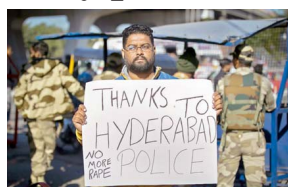
A youth holds a placard commending the Hyderabad Police for its action against the accused in the gang rape and murder of a veterinarian in Jammu.