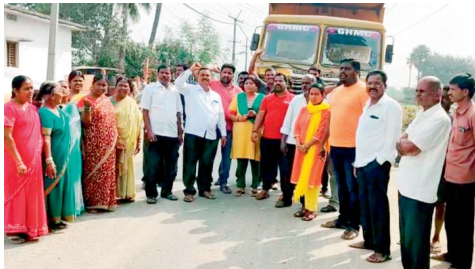
Residents of Ahmedguda blocked trucks carrying garbage from the city to the Jawaharnagar dump yard to protest the delay in the government shifting the facility on Friday.