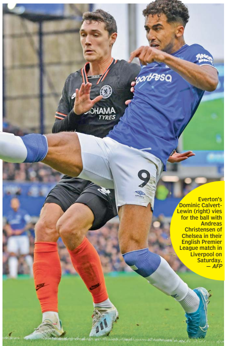
Everton's Dominic Calvert-Lewin (right) vies for the ball with Chelsea's Andreas Christensen (left) during the English Premier League match in Liverpool on Saturday.

Liverpool, Dec. 7: Chelsea slipped to their third Premier League defeat in four matches on Saturday as Everton bounced back from their Merseyside derby humiliation to win 3-1 and escape from the relegation zone. Former fans' favourite Duncan Ferguson is in control at Goodison Park after Marco Silva was sacked on Thursday and former forward had an instant impact. Goals early in each