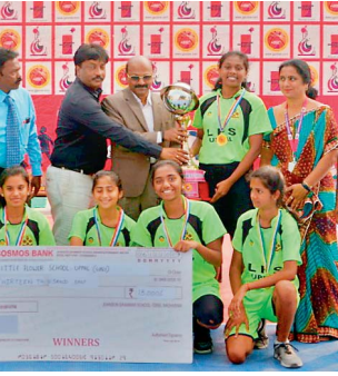
Girls from Little Flower High School pose with their medals and trophy after emerging victorious at the Inter School Prize Money Invitation Basketball Tournament organised by Johnson Grammar School CBSE, Nacharam. Little Flower won 26-22.

Lausanne, Dec. 7: UEFA on Friday opened disciplinary proceedings against Romania following racist abuse targeted at Swedish Alexander Isak in a Euro 2020 qualifier last month. The referee briefly stopped the November 15 match in Bucharest due to racist chants from Romanian fans when Real Sociedad's Isak came on as a second half substitute. Sweden won the game 2-0 to qualify for next year's tournament. European football's governing body in a statement announced that "following an inquiry a disciplinary procedure has been opened" with a verdict due from UEFA's disciplinary committee on December 12. In October, Bulgaria were fined and ordered to play one game behind closed doors after racist abuse in one of their games. — Agencies