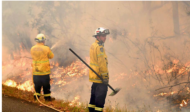
Firefighters conduct back burning measures to secure residential areas from encroaching bushfires near Sydney on Saturday. Smoke from the bushfire is causing respiratory illnesses while outdoor sports have been cancelled. Firefighters say it will take weeks to control the fire but will not be extinguished without heavy rains. So far, six people have been killed, nearly 700 houses burned down and millions of hectares of land has been razed.