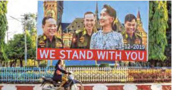
High stakes: A woman on a motorcycle riding past a huge billboard of Aung San Su Kyi and three Ministers.

and in Muslim countries, Ms. Suu Kyi’s reputation lies in tatters with multiple awards and even an honorary citizenship revoked.