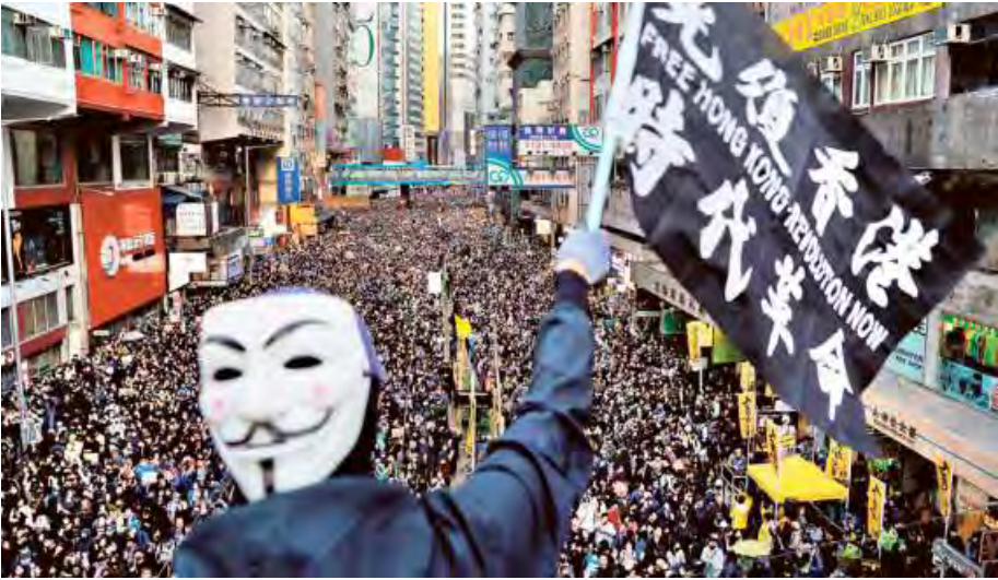
Show of strength: A protester wearing a Guy Fawkes mask waving a flag during a march, organised by the Civil Human Right Front, in Hong Kong on Sunday.

As darkness fell, some protesters spray-painted anti-Beijing graffiti on a Bank of China building. Riot police