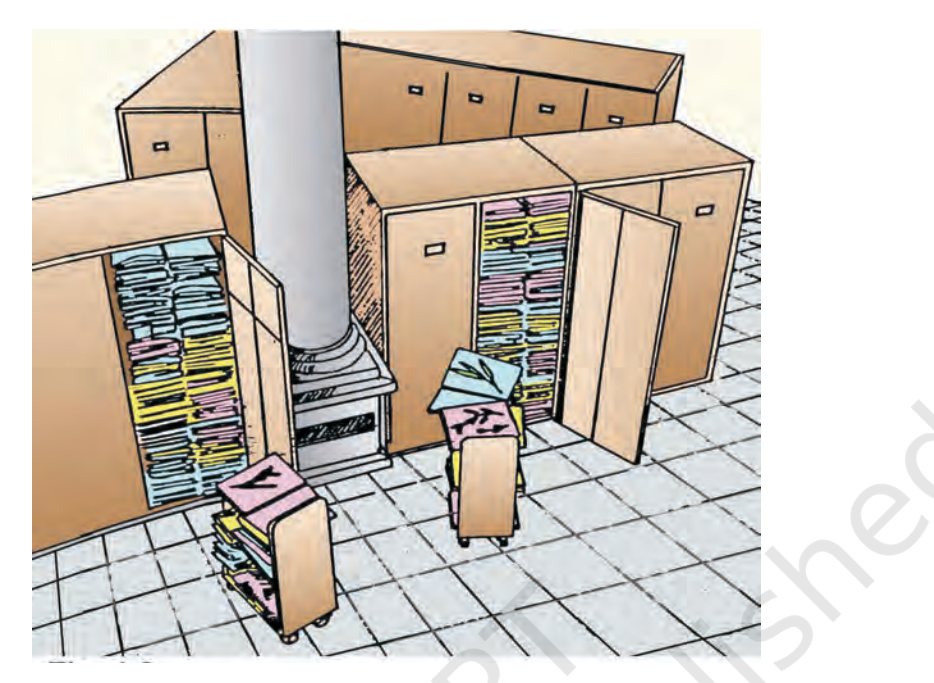
Figure 1.2 Herbarium showing stored specimens

according to a universally accepted system of classification. These specimens, along with their descriptions on herbarium sheets, become a store house or repository for future use (Figure 1.2). The herbarium sheets also carry a label providing information about date and place of collection, English, local and botanical names, family, collector's name, etc. Herbaria also serve as quick referral systems in taxonomical studies.