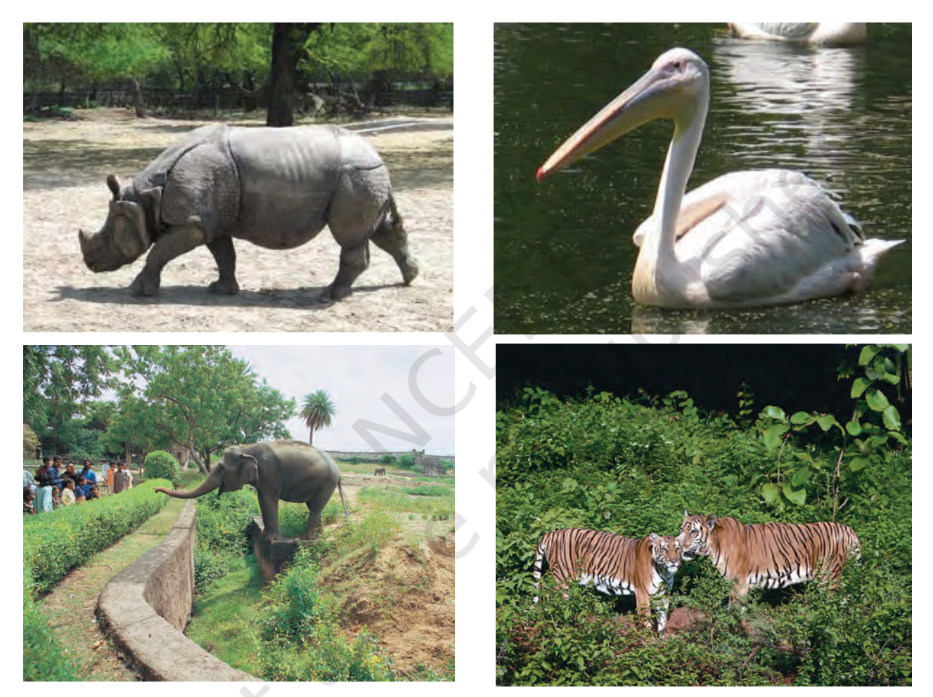
Figure 1.3 Pictures showing animals in different zoological parks of India

These are the places where wild animals are kept in protected environments under human care and which enable us to learn about their food habits and behaviour. All animals in a zoo are provided, as far as possible, the conditions similar to their natural habitats. Children love visiting these parks, commonly called Zoos (Figure 1.3).