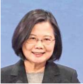
Taiwan President Tsai Ing-wen

KMT lawmakers displayed a placard reading “Protest evil law” during a parliamentary sit-in and abstained from voting on the Bill. They urged voters to punish Tsai’s