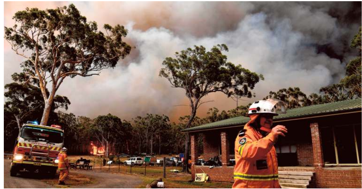
Tough task: Firefighters trying to save a property from nearby bushfires in the town of Sussex Inlet in Sydney, Australia on Tuesday. More than 200 fires are burning across the States of New South Wales and Victoria, threatening several towns.