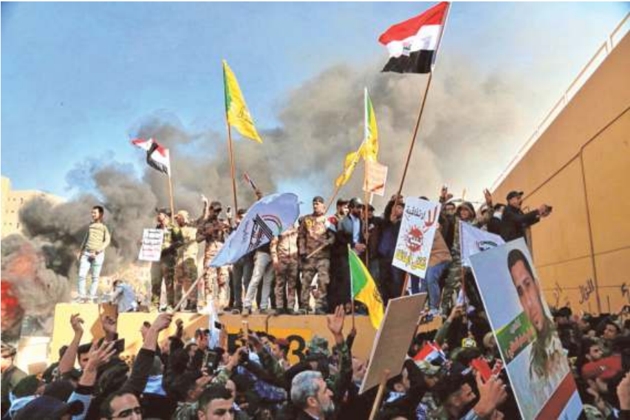
Under siege: Protesters burning property outside the U.S. Embassy in Baghdad on Tuesday.

protesting U.S. air strikes that killed at least 25 fighters from a hardline Hashed faction known as Kataeb Hezbollah (Hezbollah Brigades) on Sunday.