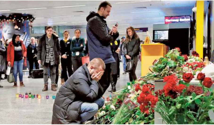
Heavy loss: Relatives of the crew members of the Ukrainian plane that crashed in Iran mourn at a memorial service at the Boryspil International airport outside Kiev on Thursday.