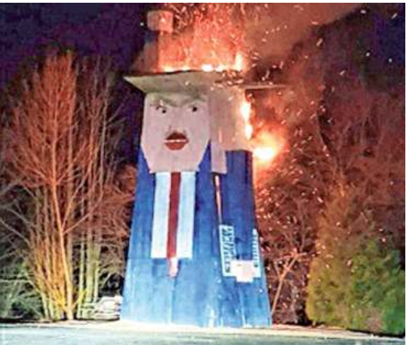
The wooden sculpture resembling U.S. President Trump on fire in Moravce, Slovenia, on Thursday.

AGENCE FRANCE-PRESSE LJUBLJANA Suspected vandals on Thursday burned a wooden statue of U.S. President Donald Trump built last year by a group of villagers to criticise populist politics, local authorities said. The statue of Mr. Trump, complete with his trademark mane, blue suit, white shirt and red tie was built last August. The statue was moved in December to Moravce, where vandals damaged it by drawing a moustache on its face in a clear reference to Hitler. On Thursday, unidentified vandals set the statue on fire.