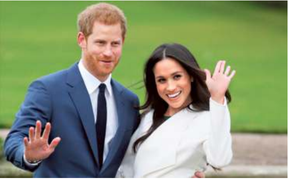
Part-time royals: A file photo of Prince Harry and wife Meghan Markle in west London.

REUTERS LONDON Britain’s royal family is hurt and disappointed by Prince Harry and his wife Meghan Markle’s surprise announcement that they will step back from their senior roles and spend more time in North America, a royal source said. Prince Harry and Ms. Markle’s decision to step away from royal duties sent shock waves through the royal family as neither Queen Elizabeth nor Prince Charles, heir to the British throne, had been consulted on the announcement, made on Instagram. The Queen, who has devoted her life to the public duty of monarchy since she became queen in 1952, and other senior members of the family felt hurt and disappointed by the move, a royal source said. “We have chosen to make a transition this year in starting to carve out a progressive new role within this institution,” the royal couple said in their statement. “We intend to step back as senior members of the Royal Family, and work to become financially independent.”