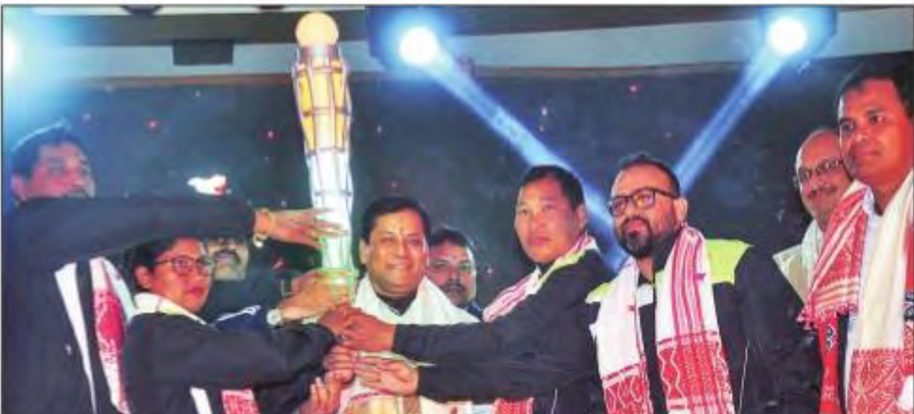
Assam Chief Minister Sarbananda Sonowal launches the torch relay of 3rd Khelo India Youth Games in Guwahati.

of giving Maharashtra and the other 34 States and Union Territories a run for their money. Delhi, Number 3 in both the earlier Games, will also be keen to move up the ladder once the action gets underway. The home state is also bidding to breach the top 10. Maharashtra (579), Delhi (450), Uttar Pradesh (430), Punjab (390) and Tamil Nadu (356) are the other States with more than 300 athletes each. Dadra and Nagar Haveli have the smallest team of three athletes, a 100m sprinter and two table tennis players representing the Union Territory. Making their Khelo India debut, the Union Territory of Ladakh is the only other team with single-digit representation with two archers and five boxers. The kabaddi event has already began in Guwahati on Thursday.