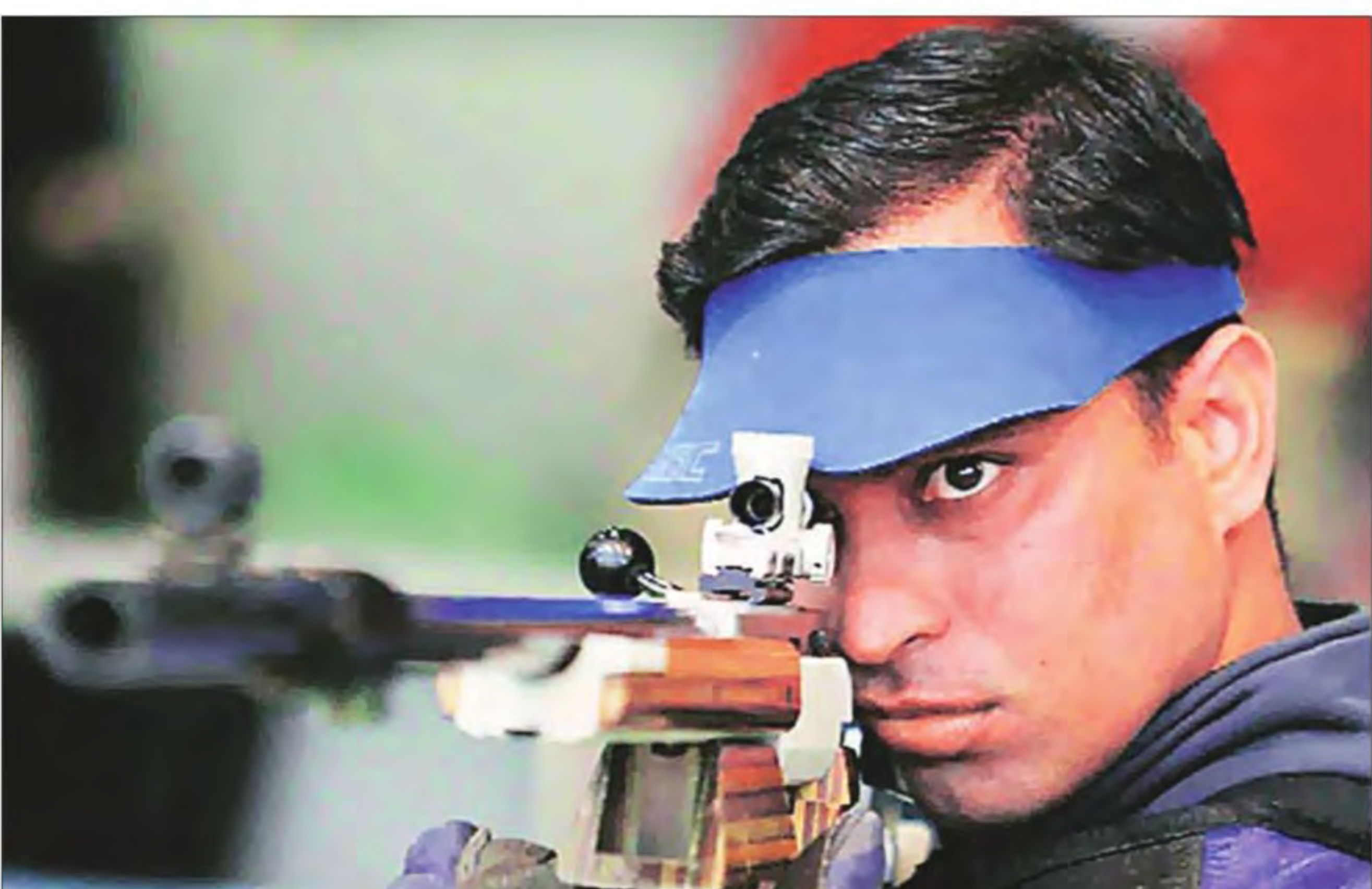
Among other curbs, the organisers have put a cap of 800 rounds per shooter for the Tokyo Olympics.

During long training stints abroad, like the 15-day camp in Doha before last year's Asian Championship, shooters buy ammunition that is available on site. "This being Olympics, though, everybody would want to carry their