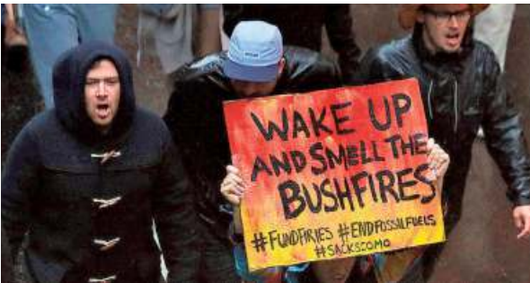
Making a stand: Protesters rally in Melbourne, in response to the ongoing bushfire crisis in Australia.

Temperatures soared above 40° Celsius in parts of New South Wales and Victo-