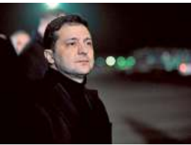
Ukrainian President Volodymyr Zelensky

In a phone call with Mr. Pompeo, he thanked Washington for its support.