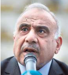
Iraq’s caretaker premier Adel Abdel Mahdi

“At this time, any delegation sent to Iraq would be dedicated to discussing how to best recommit to our strategic partnership – not to