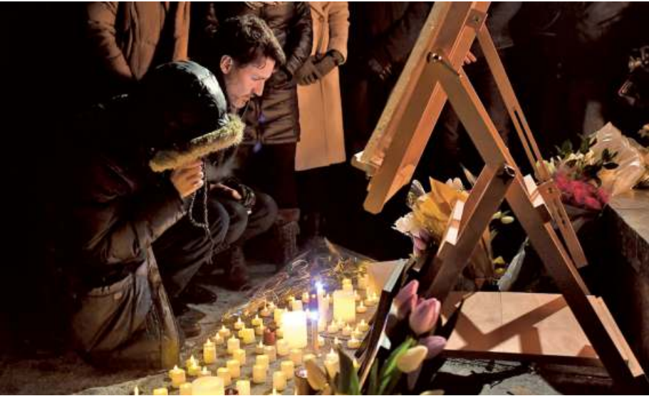
Paying tribute: Canadian Prime Minister Justin Trudeau at a candlelight vigil in Ottawa on Thursday for the victims of the plane crash in Tehran.

And “the debris collected has been in a very limited area. If there was an explosion in the wings it should have been much more scattered,” he added, noting that analysing the black box data “will take time”.