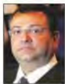
Tribunal had reinstated Cyrus Mistry as Executive Chairman

[PTI adds: The bench said the NCLAT's decision suffers from "basic errors and we have to hear