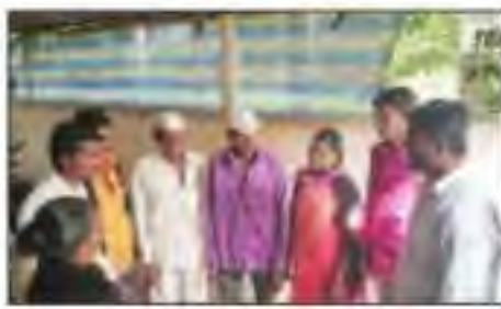
The rescued workers in Ahmednagar.

"They would call us dogs, and other bad words for women... There was no cooking oil, nor any vegetables, ever. There was dried fish, foodgrain and atta, so I would cook these in water, making everything spicy to mask the rawness."