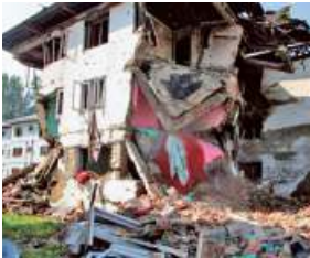
Buildings damaged during a fidayeen attack in Pulwama in August 2017.