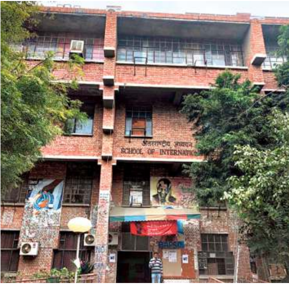
The winter semester began on Monday.