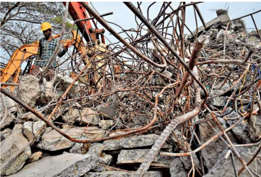
Huge task ahead: Workers removing debris from the site of the demolished buildings at Maradu, near Kochi, on Monday.