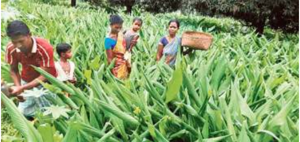
Turmeric being cultivated by a tribal family in Swabhiman Anchal. ■SPECIAL ARRANGEMENT

A survey in 2019 by the Malkangiri district administration revealed that almost all tribal families grow tur-