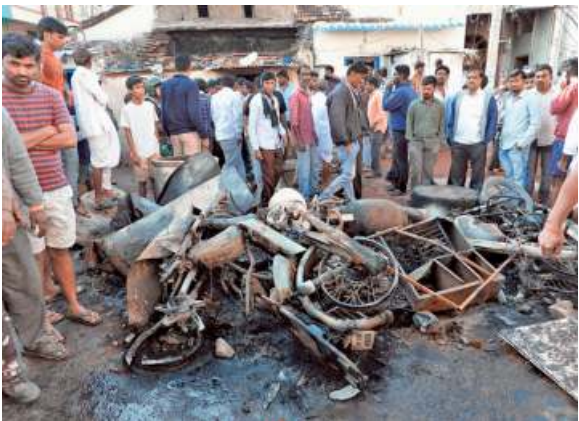
Two-wheelers that were set on fire at Korbagalli in Bhainsa, Nirmal district, on Sunday night.

the 2019 Lok Sabha polls, also took part in the rally. Giving a new twist to the controversy, an HJV pamphlet and several speakers at the rally claimed that Kapalabetta was originally called "Muneeshwara Betta", a holy site of Hindus. However, Kapalabetta and Muneeshwara Betta are two different hillocks, at least two km apart, in two villages, Harobe and Kadle Doddi respectively