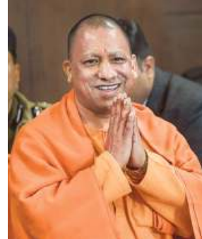
CM Yogi Adityanath in Lucknow on Monday.

"In police commissioner system, police works as a