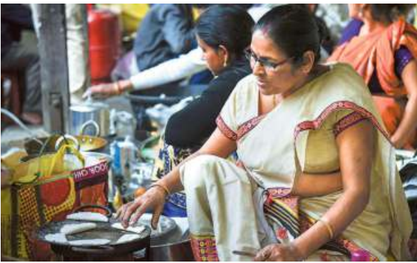
Women preparing traditional food 'pitha' in Guwahati on Monday.

Organisations such as Asom Jatiyatabadi Yuba Chhatra Parishad and Cotton University Students' Union have given similar calls.