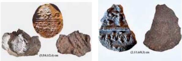
The site where the excavations were carried out and (below) the seals which have been deciphered to reveal names of the Buddhist monasteries.