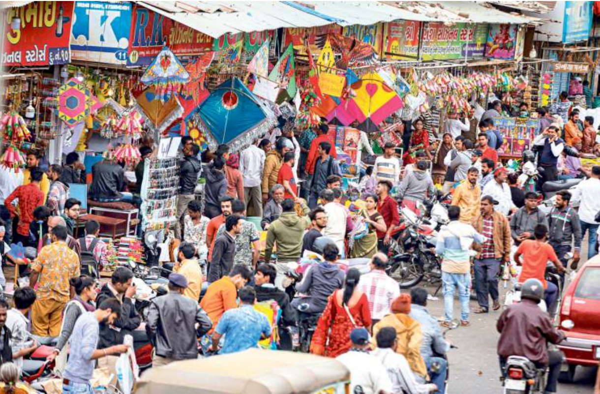
Colours of spring: The kite market is bustling with activity and a festive crowd on the eve of Uttarayan, the kite-flying festival, in Ahmedabad on Monday.