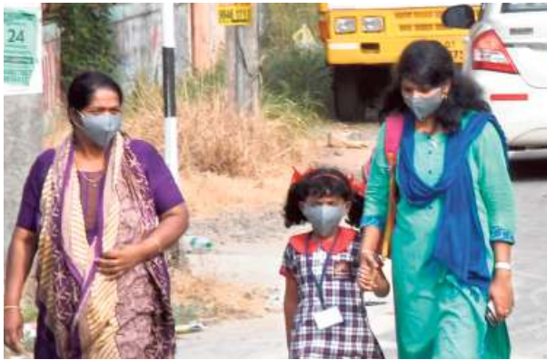
Residents of Maradu wearing masks to escape dust.