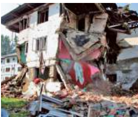
Buildings damaged during a fidayeen attack in Pulwama in August 2017.