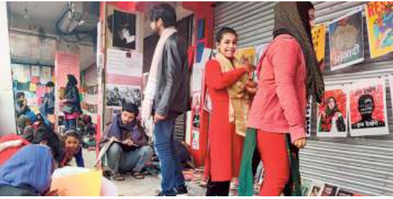
Youngsters stand near posters put up in Shaheen Bagh on Monday. • SIDHARTH RAVI

With mattresses laid out in the space, volunteers