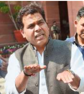
Minister Shrikant Sharma