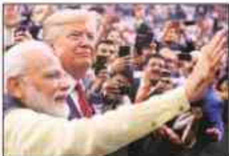
Govt hopes to host Trump before US elections this year

However, unlike last time, when India had invited the President to attend the Republic Day celebrations as the chief