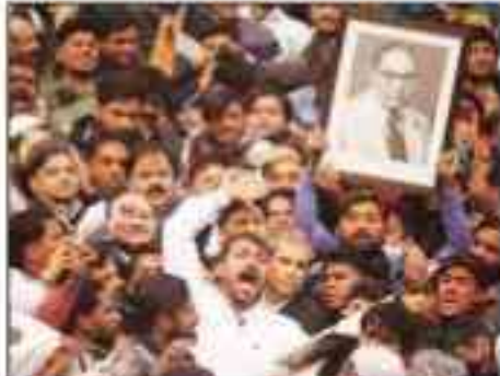
Arrested on Dec 21, Bhim Army chief has sought bail

Azad was arrested in the early hours of December 21 after he emerged from the Jama Masjid