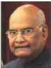
President Ram Nath Kovind

This time, the awards have 11 categories covering critical areas in print, digital and electronic media, including business and economics, political reportage, civic journalism, environment, science and technology, journalism in conflict areas, and re-