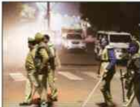
Muzaffarnagar witnessed violence last month. File

So far, 19 people have been released on bail, either by police