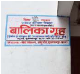
A view of the Muzaffarpur shelter home.

in view of the CBI's statement in the Supreme Court that 35 girl inmates earlier believed to have been murdered had been found to be alive.