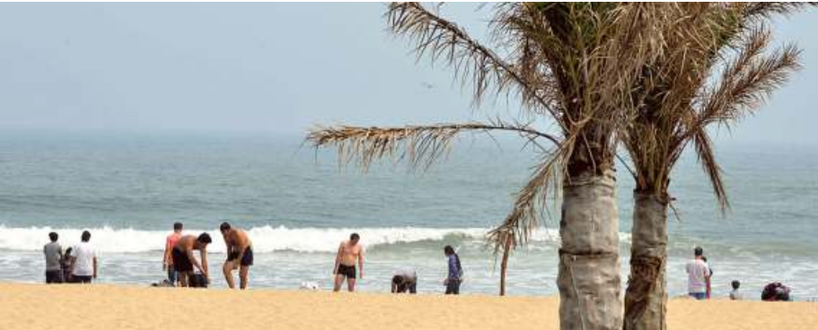
Sea view: Tourists at Eden beach in Chinna Veerampattinam near Puducherry. The Ministry has selected 13 beaches in India to vie for the certificate.

The earmarked beaches are – Ghoghala beach (Diu), Shivrampur beach (Gujarat), Bhogave beach (Maharashtra), Padubidri and Kasarkod beaches (Karnataka), Kappad beach (Kerala), Kovalam beach (Tamil Nadu), Eden beach (Puducherry), Rushikonda beach (Andhra Pradesh), Miramar beach (Goa),