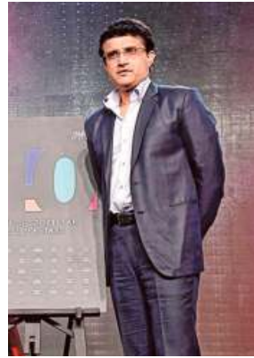
Sourav Ganguly.

The top brass from the BCCI and Cricket Australia met here over the last couple of days, along with members