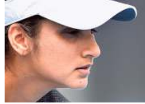
Sania Mirza.

"Today was one of the most special days of my life.