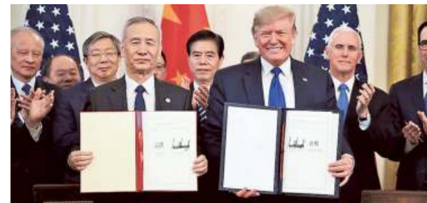
U.S. President Donald Trump with Chinese Vice Premier Liu He after signing the trade deal in Washington.

REUTERS BEIJING/WASHINGTON China will boost purchases of U.S. goods and services by $200 billion over two years in exchange for the rolling back of some tariffs under an initial trade deal signed by the world’s two largest economies, defusing an 18-month row that has hit global growth. Key world stock market indexes climbed to record highs after the deal was signed on Wednesday in Washington, but later stalled on concerns over unresolved thorny issues. President Donald Trump hailed the agreement as a win for the U.S. economy and his administration’s