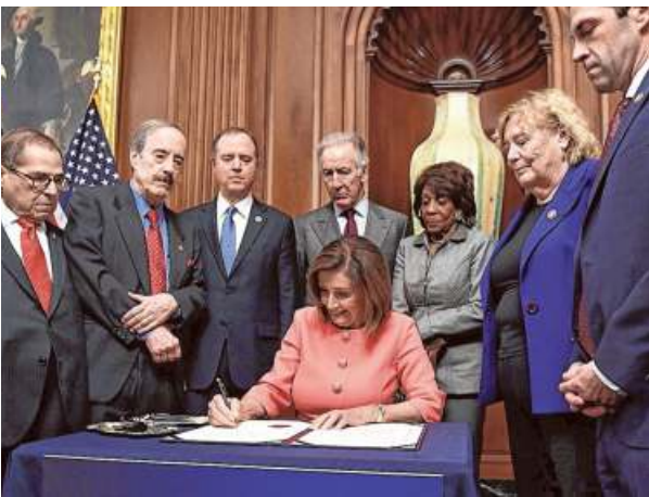
Final phase: House Speaker Nancy Pelosi signing the articles of impeachment against President Trump on Wednesday.

The events on Capitol Hill unfolded as the House released a second set of documents related to Lev Parnas, an indicted associate of the President’s personal lawyer Rudy Giuliani. The documents and interviews Mr. Parnas had this week with U.S. media outlets appear to further bolster the case against Mr. Trump – specifically that the President used his office to advance his own interests by trying to get the Ukrainian administration to publicly announce an inves-