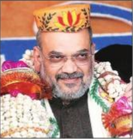
Amit Shah in Vaishali on Thursday.

Exhorting people to go to door to door to clear misconceptions about the CAA, the minister said that even Mahatma Gandhi had spoken against India shielding religious minorities. “Jawaharlal Nehru also said as much. If the Congress cannot lis-